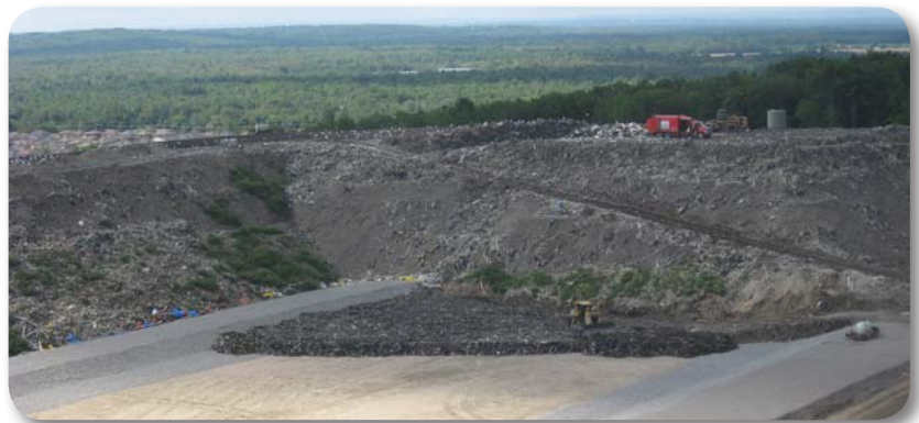
Waste is placed into a newly lined cell at the landfill

Work has now returned to regular hours, which includes activities 6 days a week. Residents are encouraged to report any odours to City staff so that work can be altered appropriately. Please contact call 705-739-4220 ext. 4516 if you have any concerns about odours resulting from the Project.