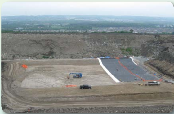
Summer 2011: Installation of the Phase 2 liner

This fall we will continue Phase 2 work, including installing additional liners and Leachate Collection Systems, and relocating waste to the completed cells. Where possible, work will also continue through the winter.