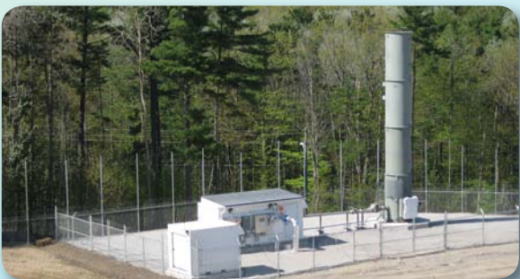
Landfill Gas Collection and Flaring Plant