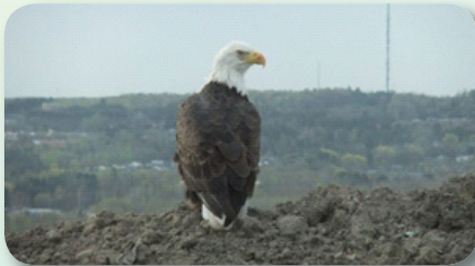
Bald Eagle at the Barrie Landfill

Last year, we completed an Air Quality and Health Study that determined that the main causes of odour from the landfill are sulphur compounds; these compounds do not pose a health concern to the public.