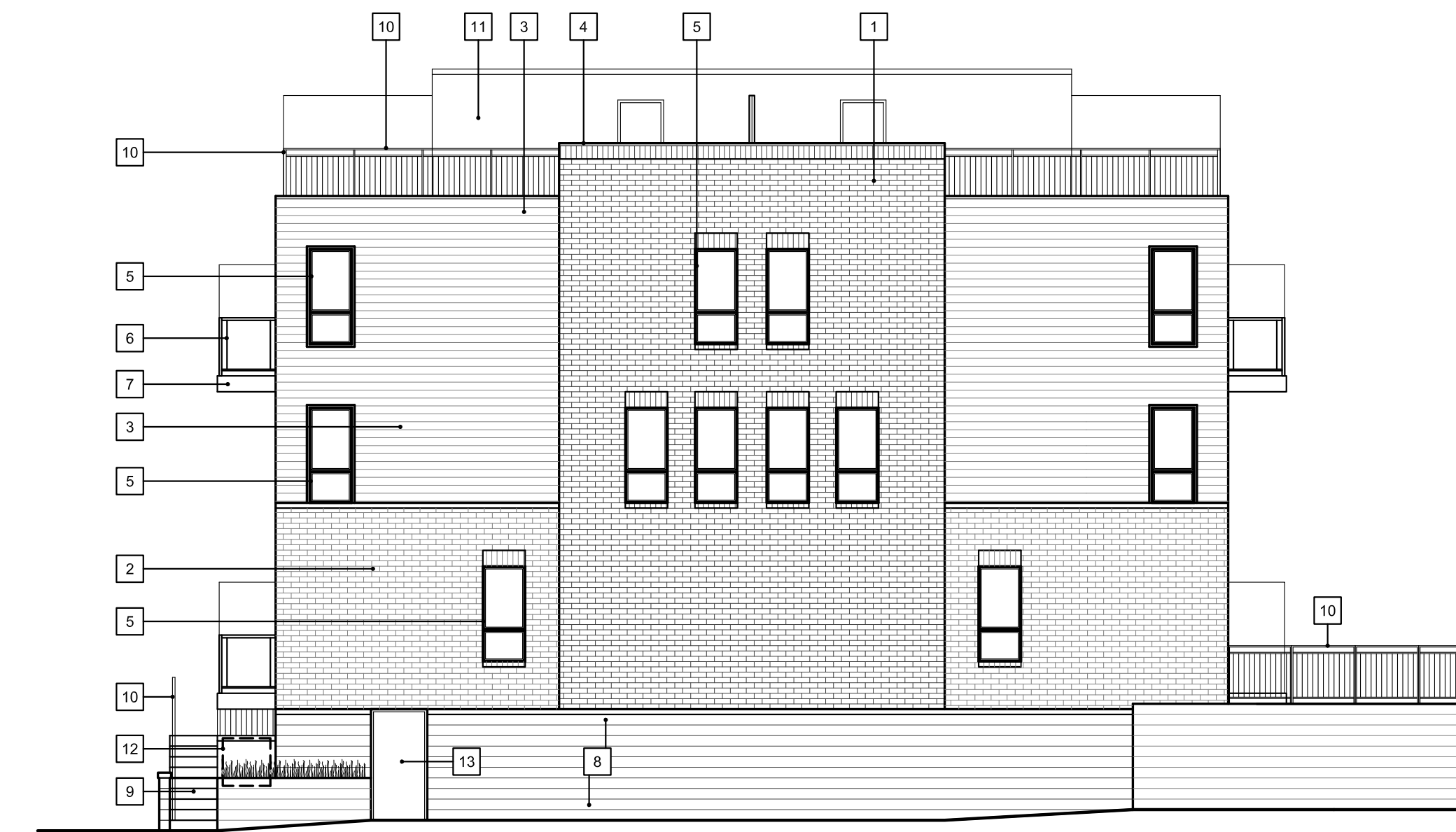
2 SIDE YARD ELEVATION A-2.1 SCALE: 1:100