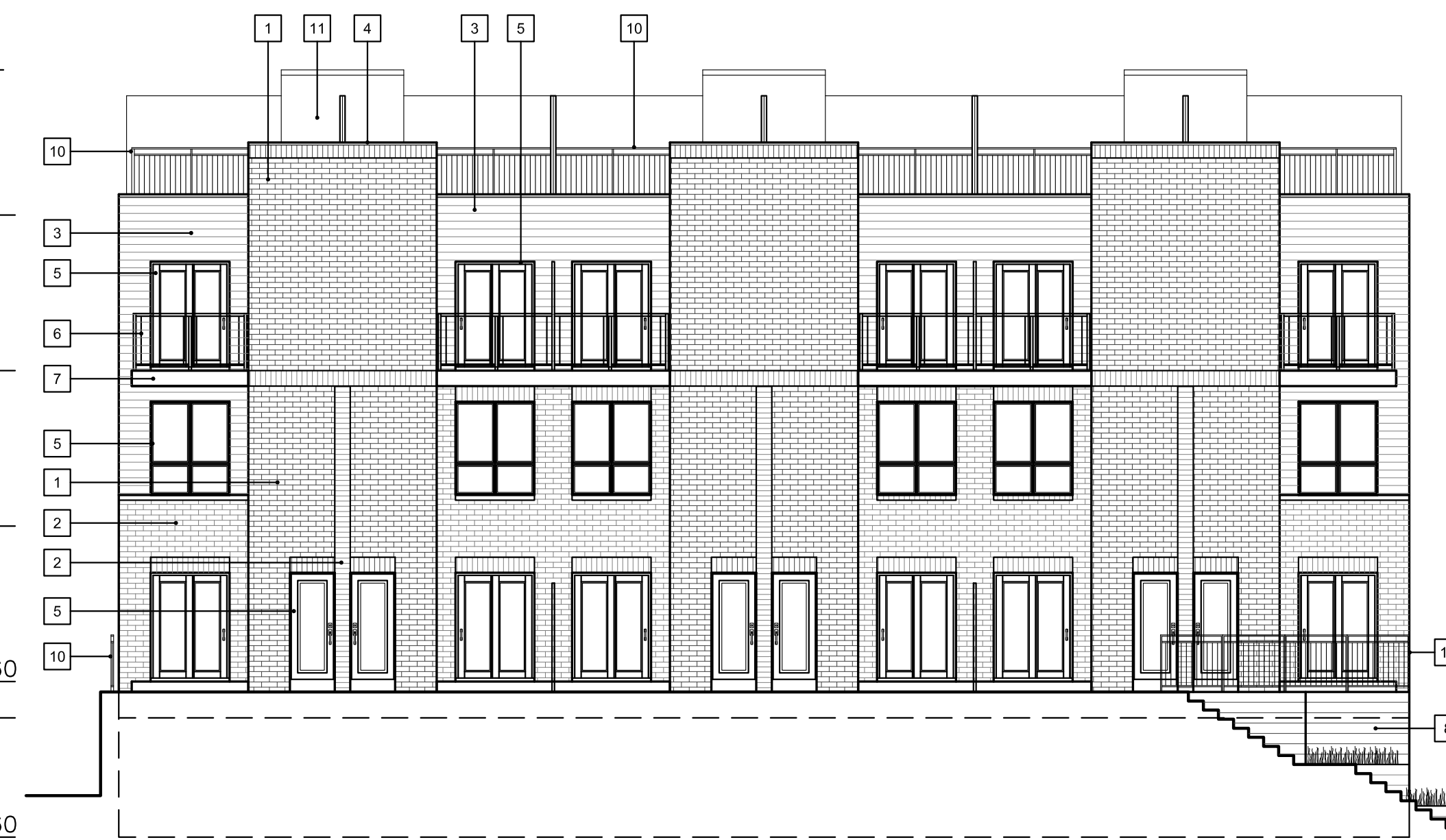
4 COURTYARD ELEVATION A-2.1 SCALE: 1:100