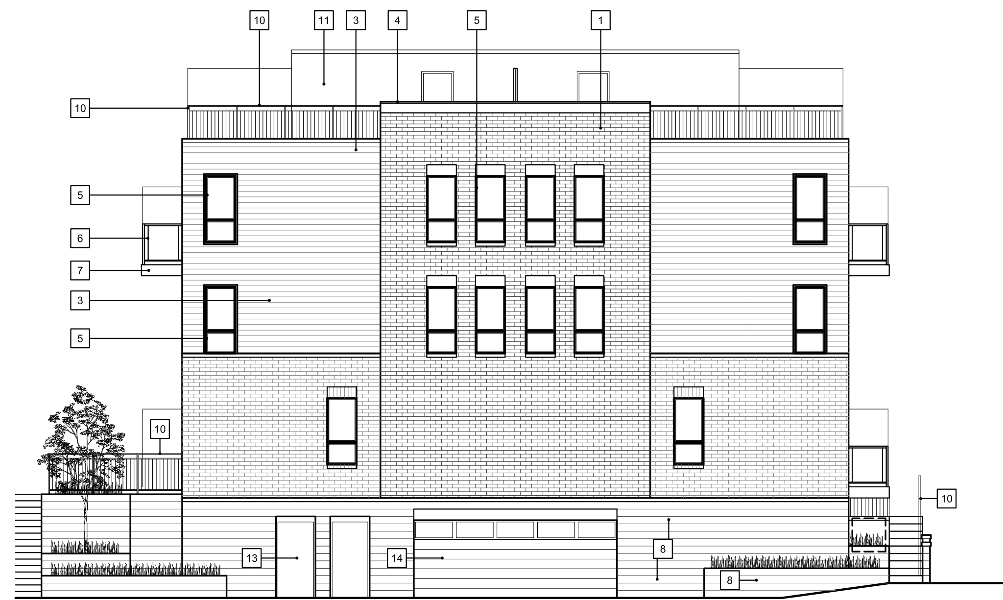
3 SIDE (DRIVEWAY) ELEVATION A-2.1 SCALE: 1:100