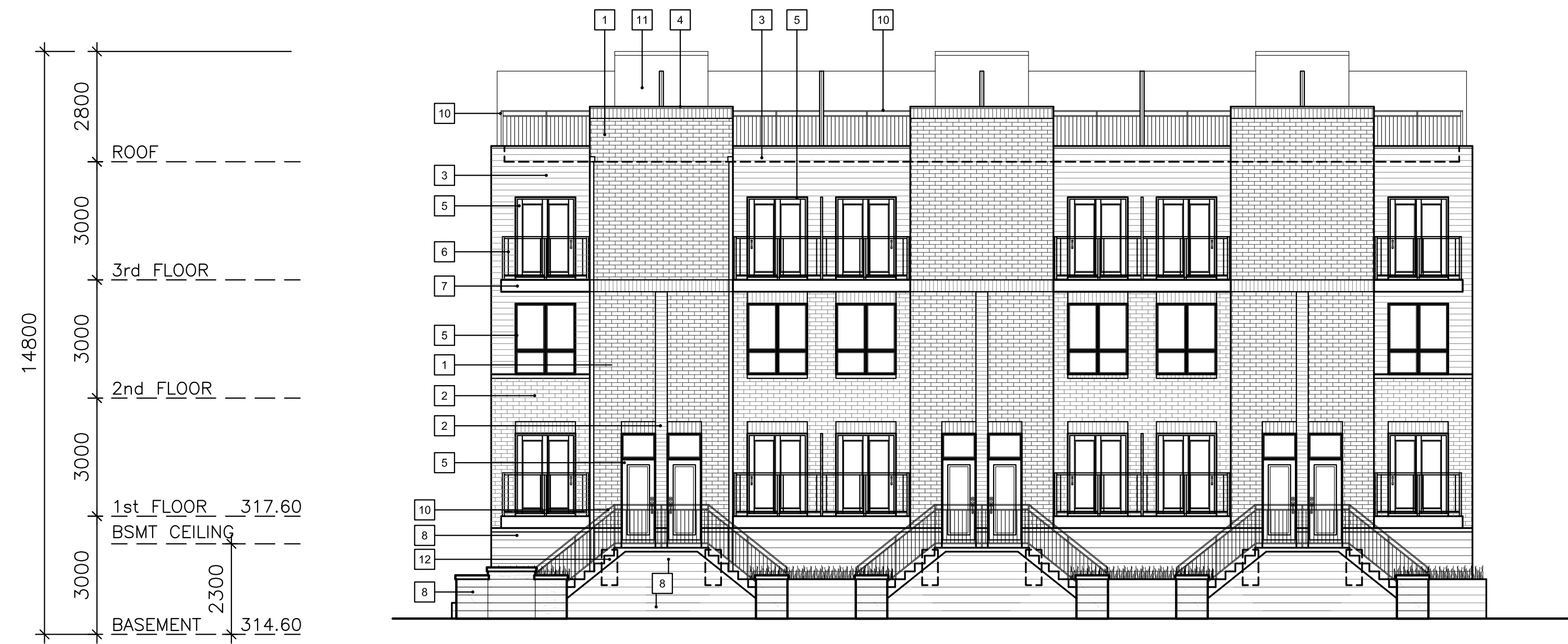
1 FRONT (STREET) ELEVATION A-2.1 SCALE: 1:100

Do Not scale this drawing. This drawing shall not be used for construction purposes unless counterchecked. Patrick Markus Luckie Architect