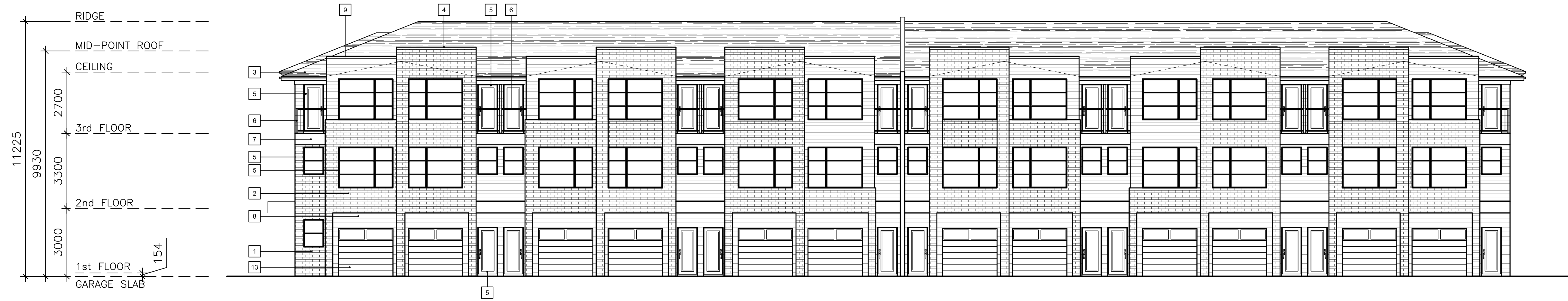
1 FRONT (DRIVEWAY) ELEVATION A-2.2 SCALE: 1:100

Do Not scale this drawing. This drawing shall not be used for construction purposes unless counterchecked. Patrick Markus Luckie Architect