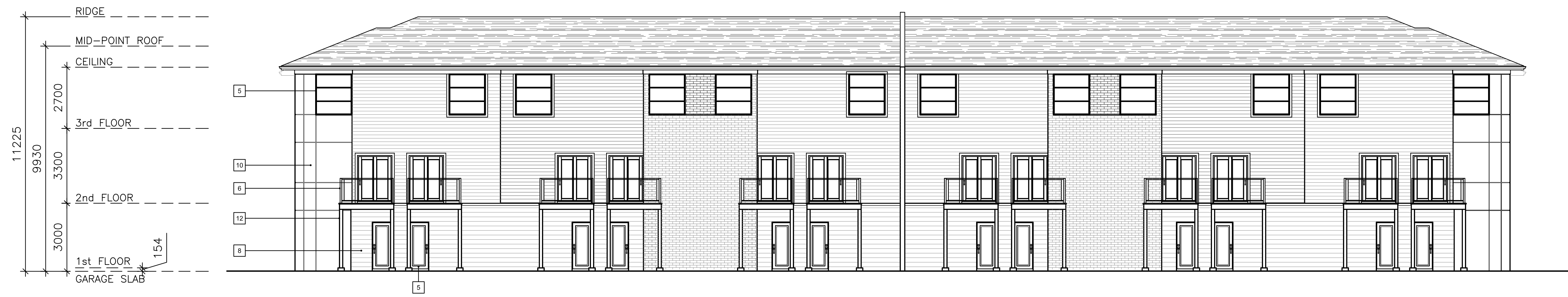
4 REAR (SIDE YARD) ELEVATION A-2.2 SCALE: 1:100