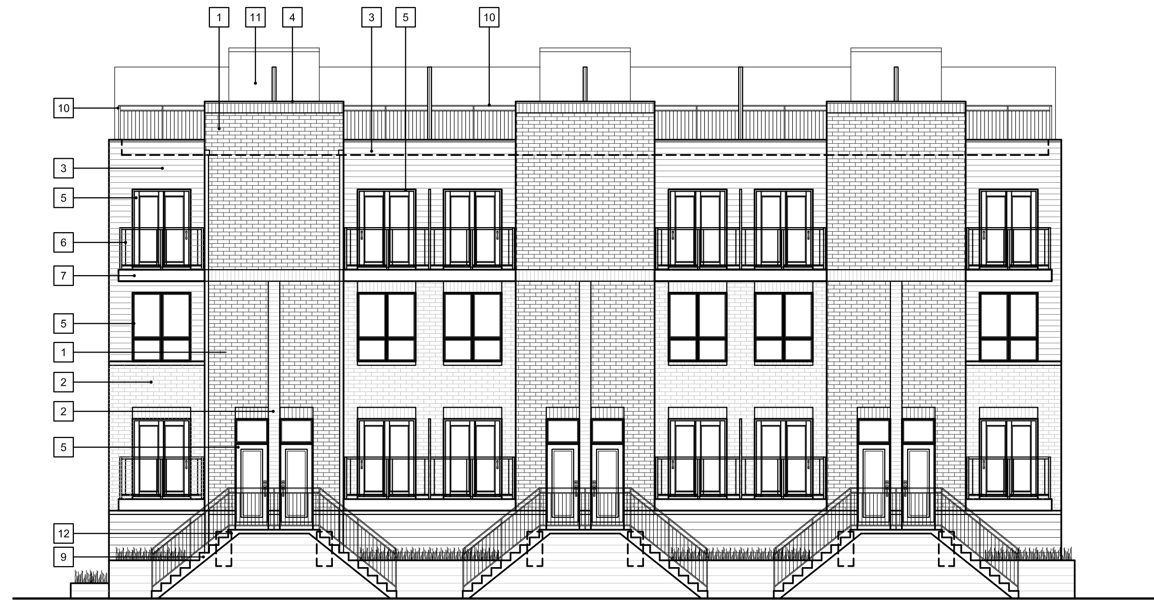
1 FRONT (STREET) ELEVATION A-2.1 SCALE: 1:100