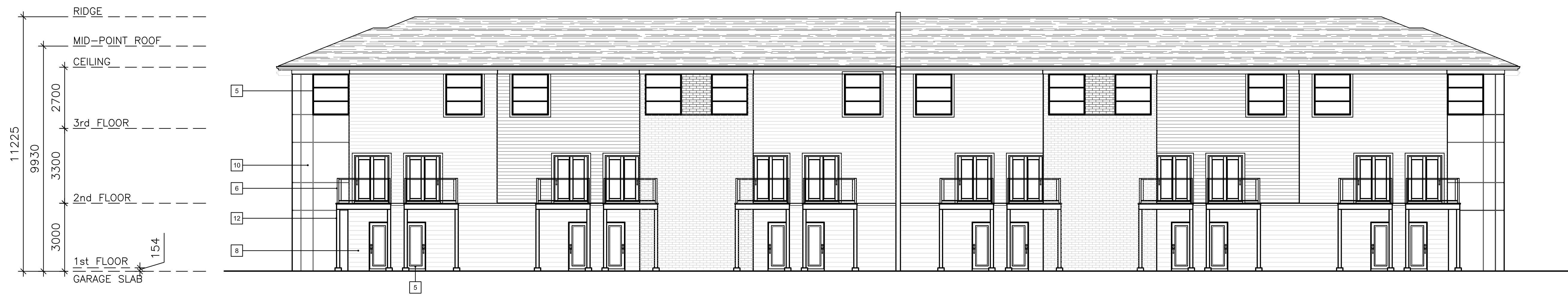
4 REAR (SIDE YARD) ELEVATION A-2.2 SCALE: 1:100