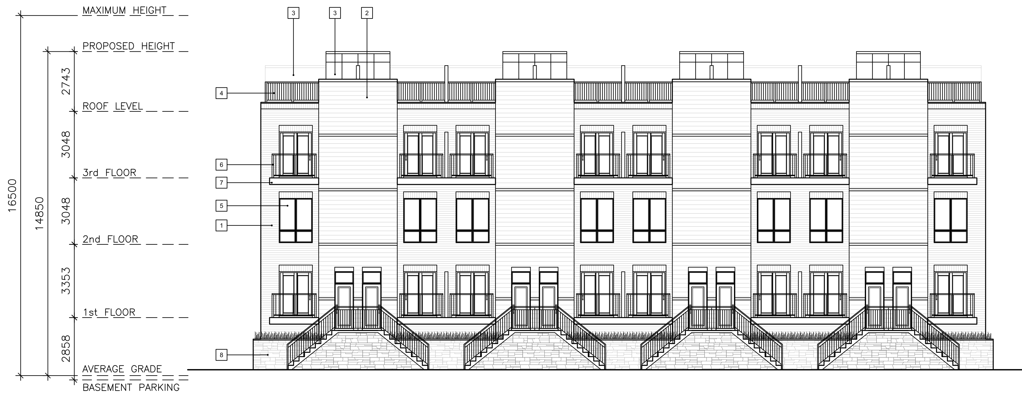
1 FRONT ELEVATION A-2.1 SCALE: 1:100

Do Not scale this drawing. This drawing shall not be used for construction purposes unless counterchecked. Patrick Markus Luckie Architect