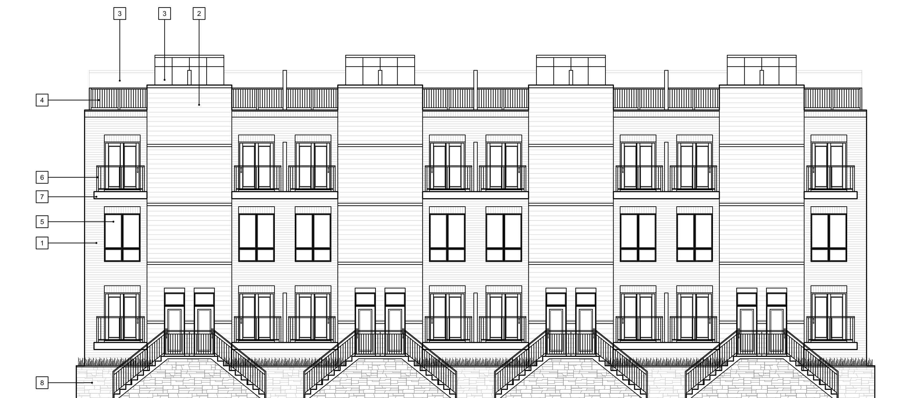
4 REAR ELEVATION A-2.1 SCALE: 1:100