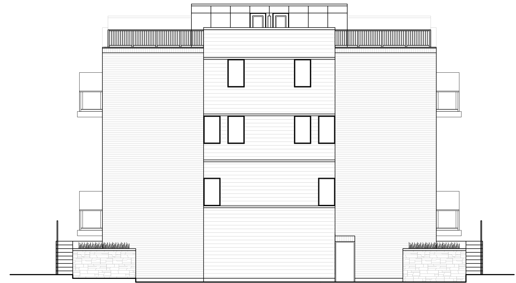
2 NORTH SIDE ELEVATION A-2.1 SCALE: 1:100