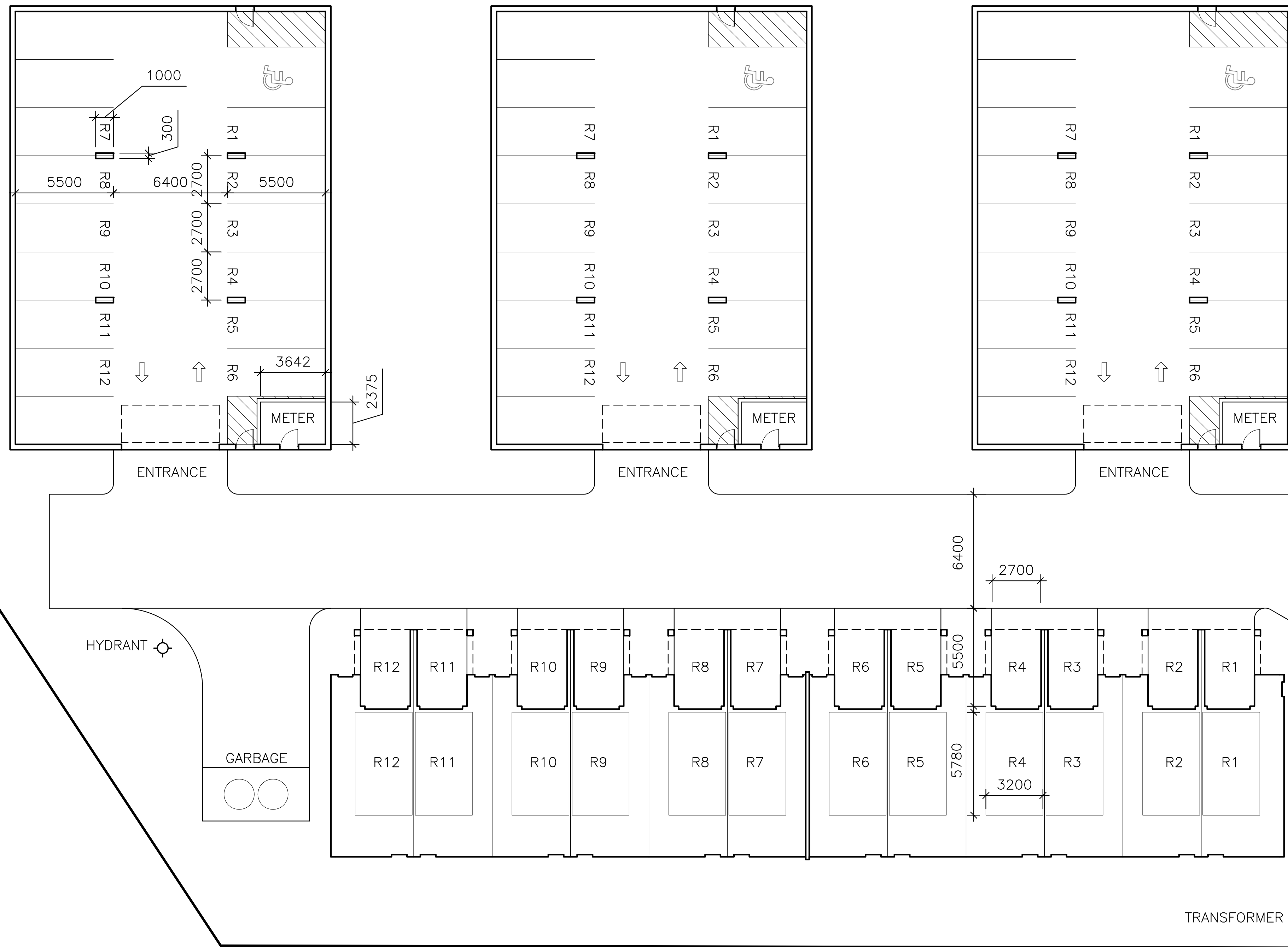
1 PARKING PLAN A-0.1b SCALE: 1:150