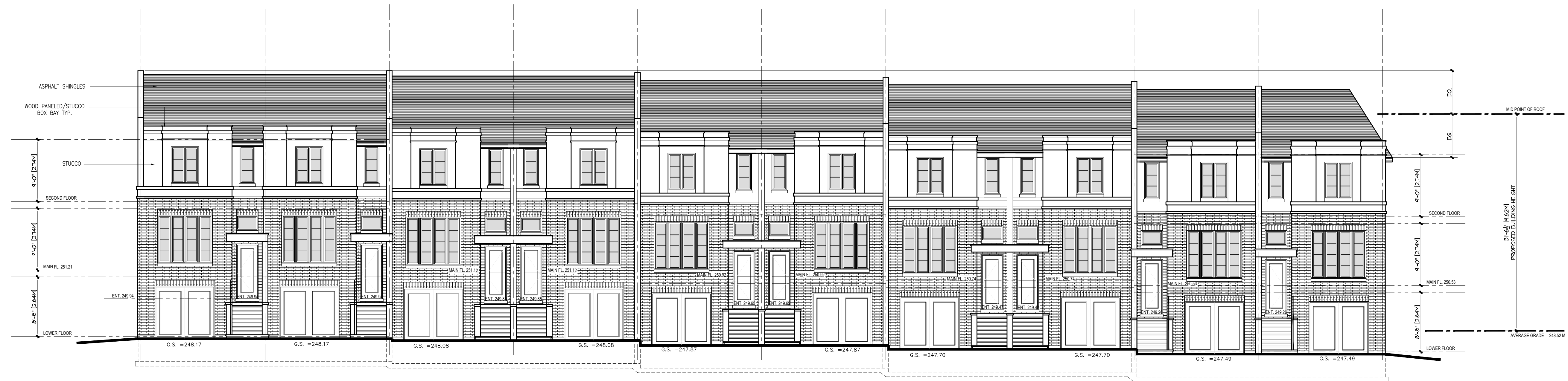
FRONT ELEVATION - BLOCK "B"

These architectural drawings are the property of Peter Higgins Architect Inc. 1560 Bayview Avenue, Suite 302, Toronto, Ontario. In consideration for full payment of the architectural services rendered, the use of these drawings and any supporting attachments is granted to the client/agency responsible for the construction of the forementioned titled project, as designed, depicted and detailed on these drawings. These architectural drawings shall not be reproduced or used for any other purpose at any other address by any other person, firm or corporation without the written consent of Peter Higgins Architect Inc. SEE DRAWING A-1 FOR GENERAL AND CONSTRUCTION NOTES