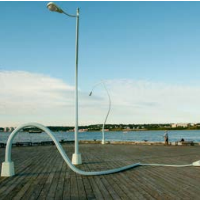
➤ C. 'Get Drunk, Fall Down'