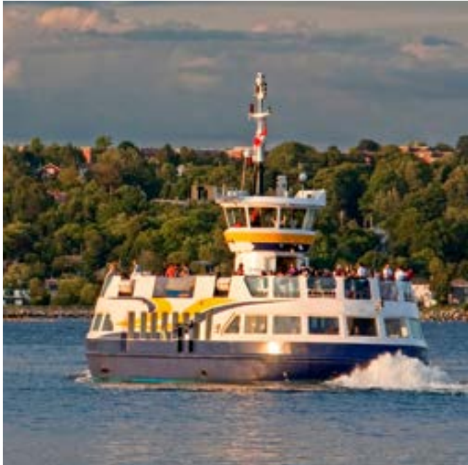
➤ B. Halifax Ferry