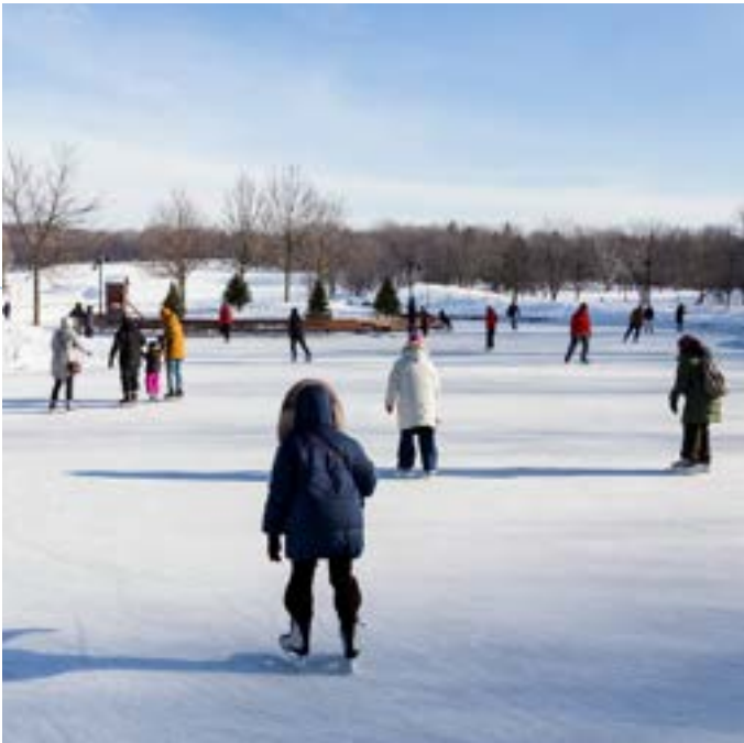
B. Outdoor Skating Rink