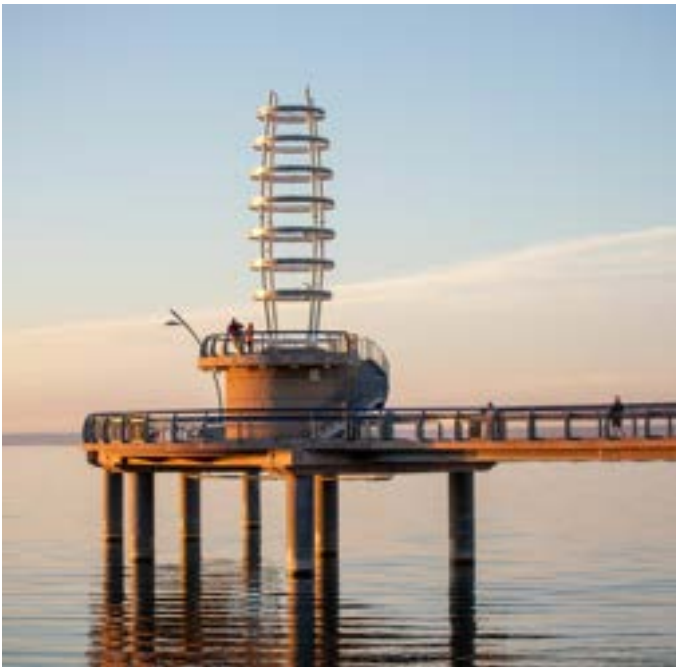
➤ A. Brant Street Pier