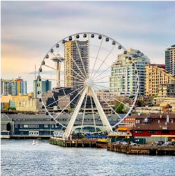
➤ B. Ferris Wheel