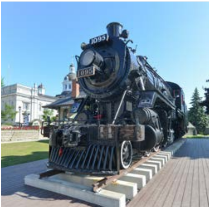
➤ D. Locomotive CPR 1095/ "The Spirit of Sir John A."