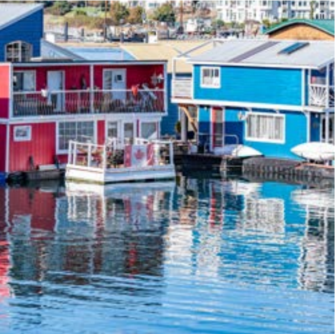
➤ C. Fisherman's Wharf