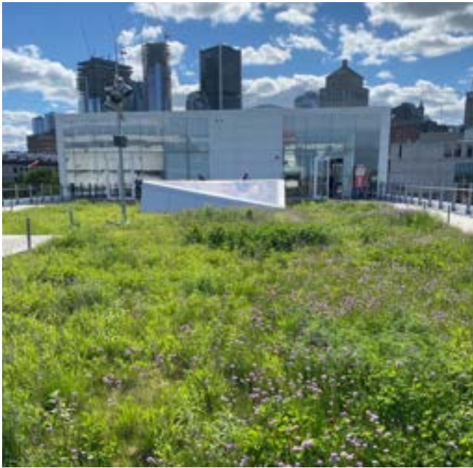
E. Promenade D'Iberville (Green Roof)