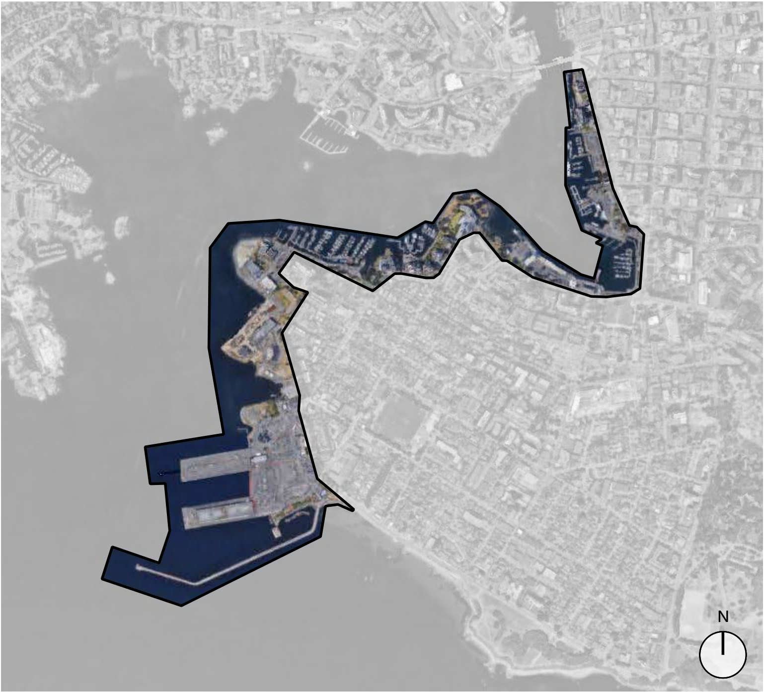
Victoria Harbour