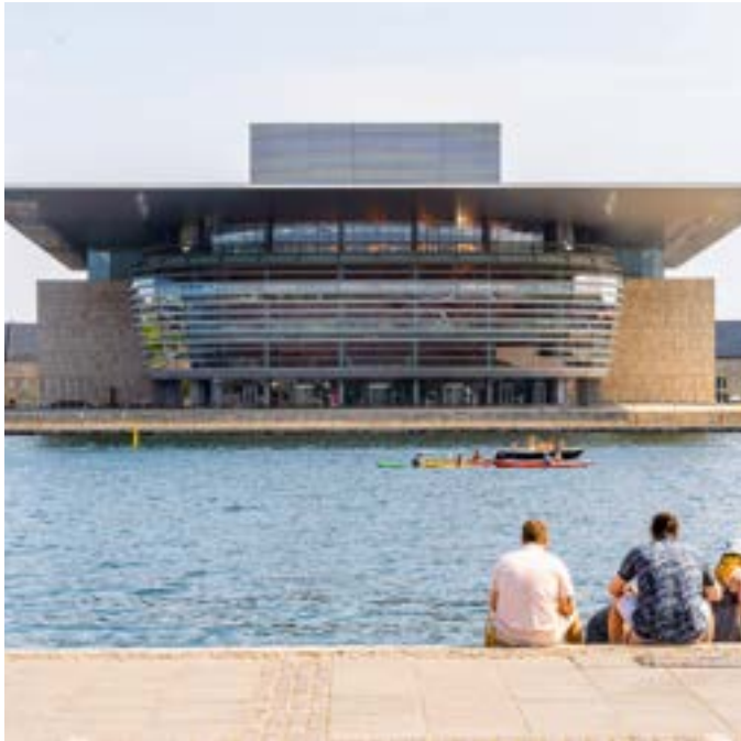
➤ C. Opera House