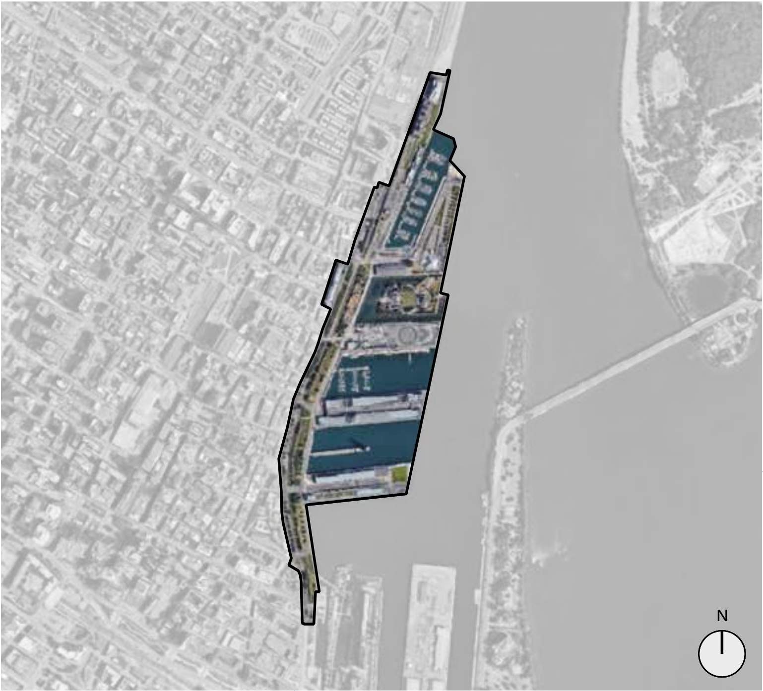
➤ Old Port of Montreal