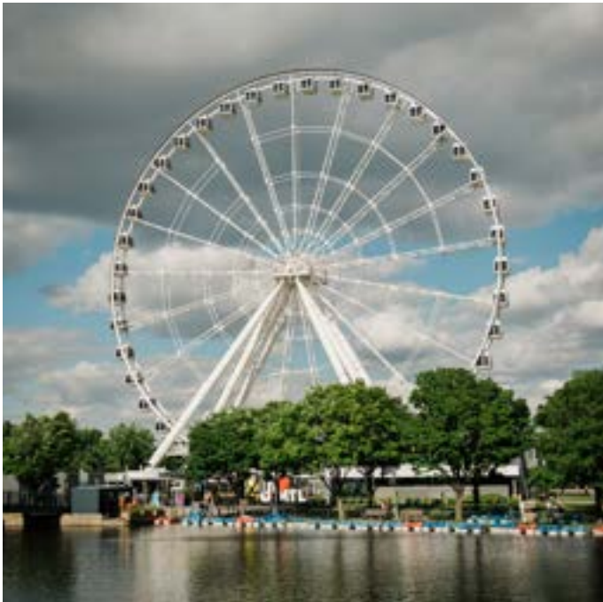
C. La Grande Roue