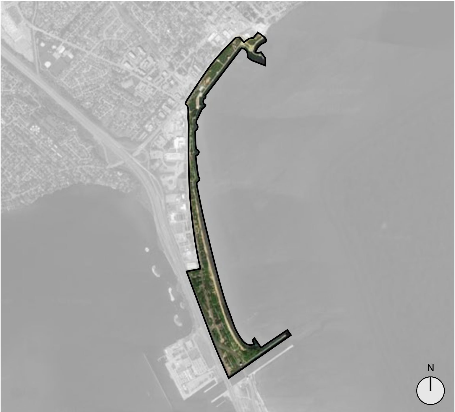
Burlington Waterfront