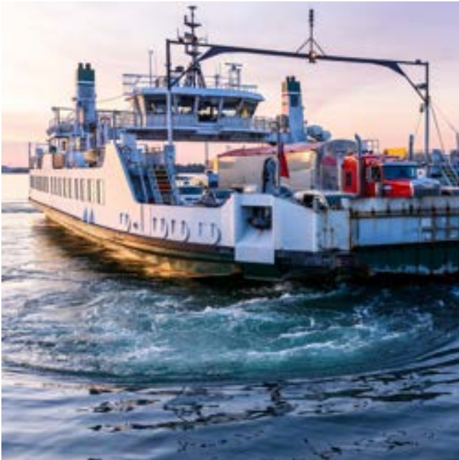
➤ A. Wolfe Island Ferry