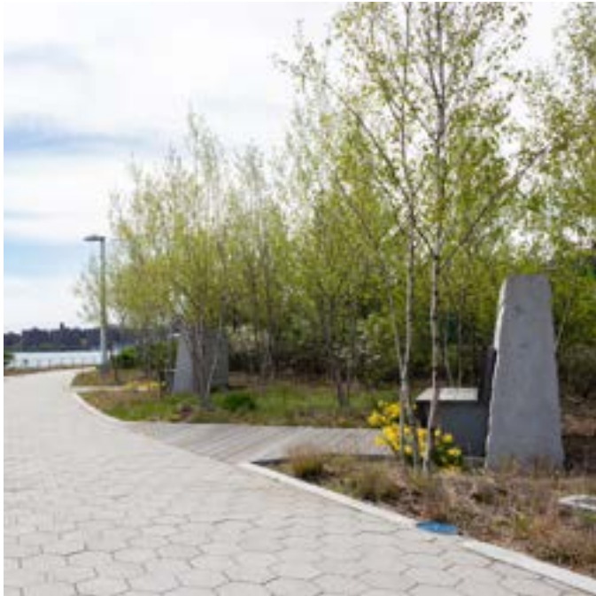
➤ C. Hunter's Point South Park