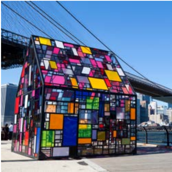
➤ D. Brooklyn Bridge Stained Glass House