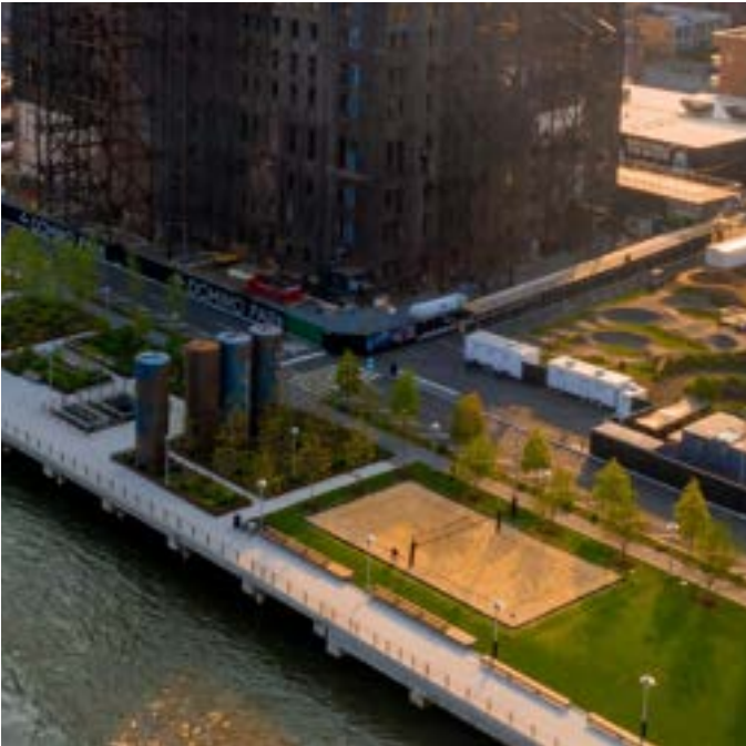
➤ E. Domino Park Volleyball Court