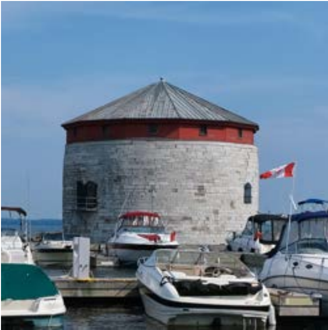
➤ B. Murney Tower National Historic Site of Canada