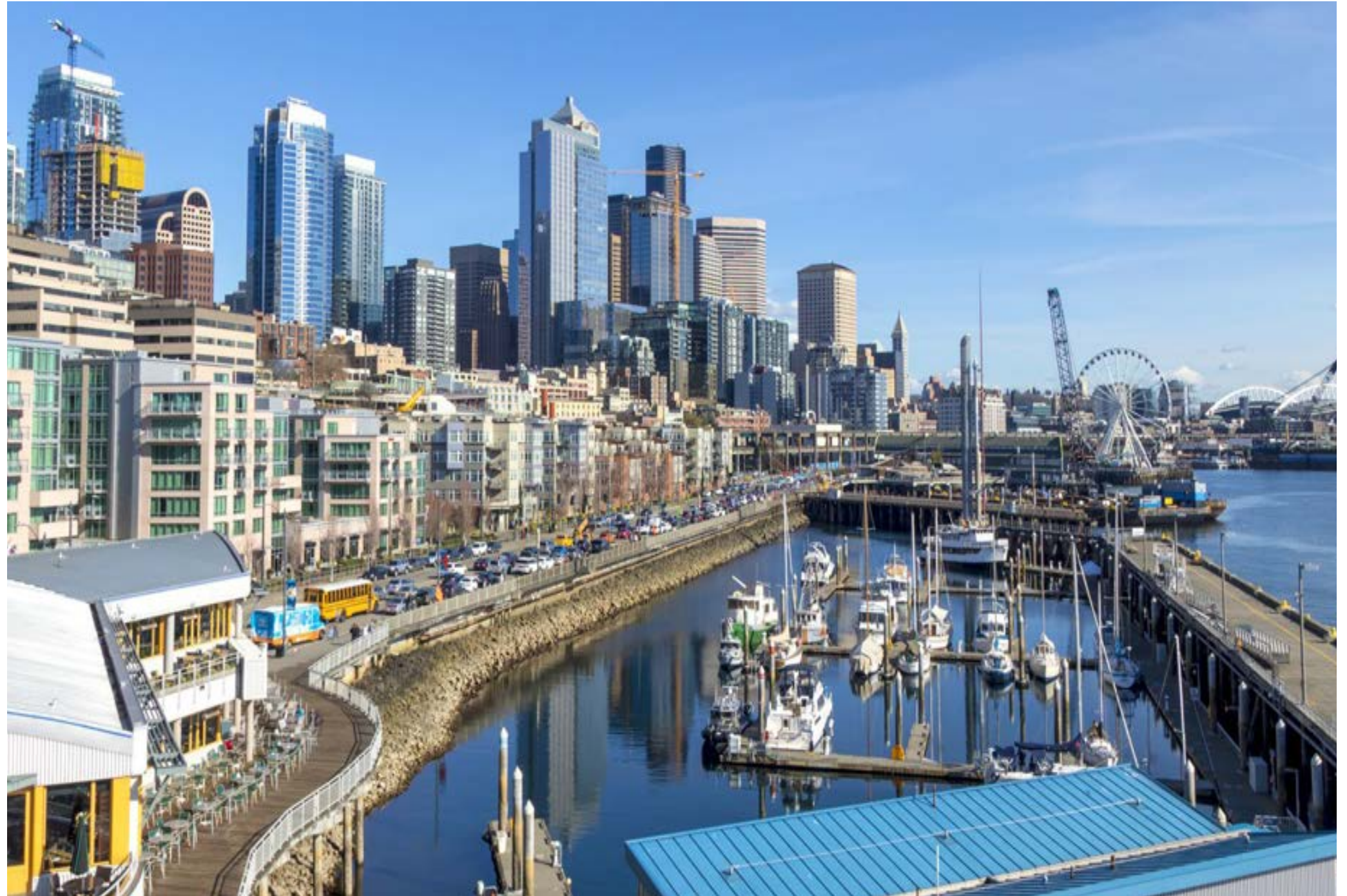
➤ Bell Harbour Marina