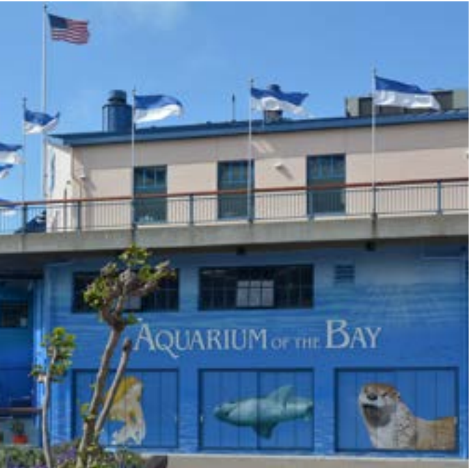
➤ E. Aquarium of the Bay