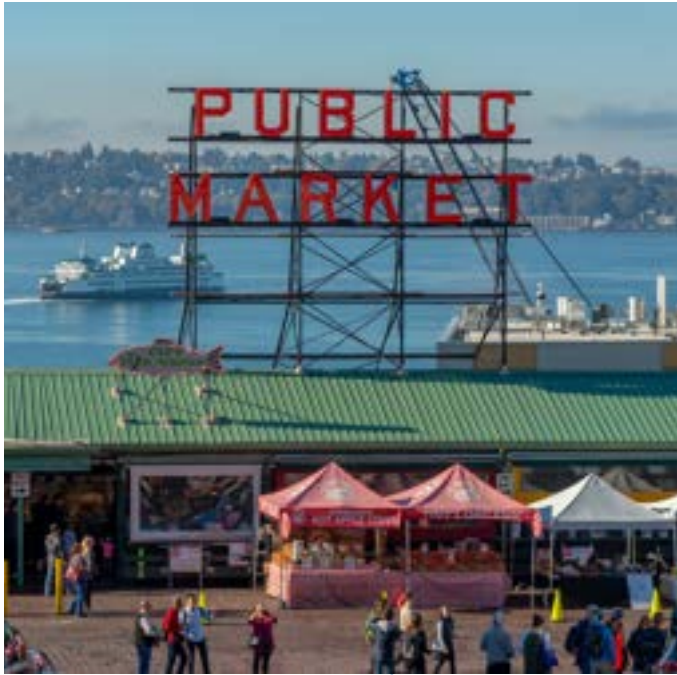
➤ D. Public Market Center