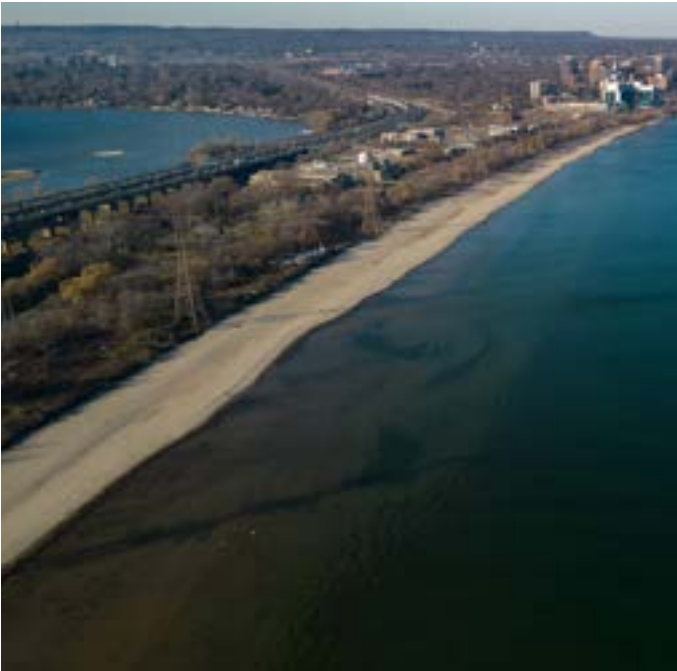
➤ D. Burlington Beach