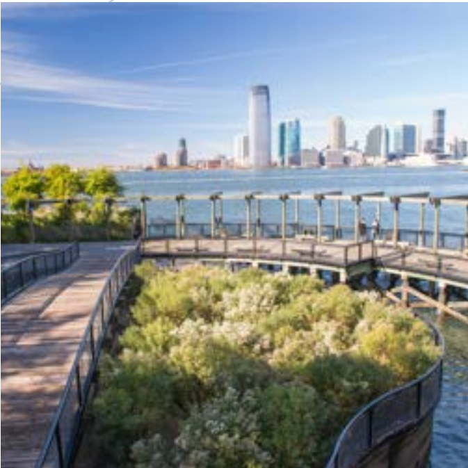
➤ F. Battery Park