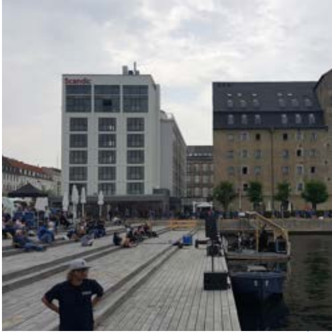
➤ D. The Kissing Stairs