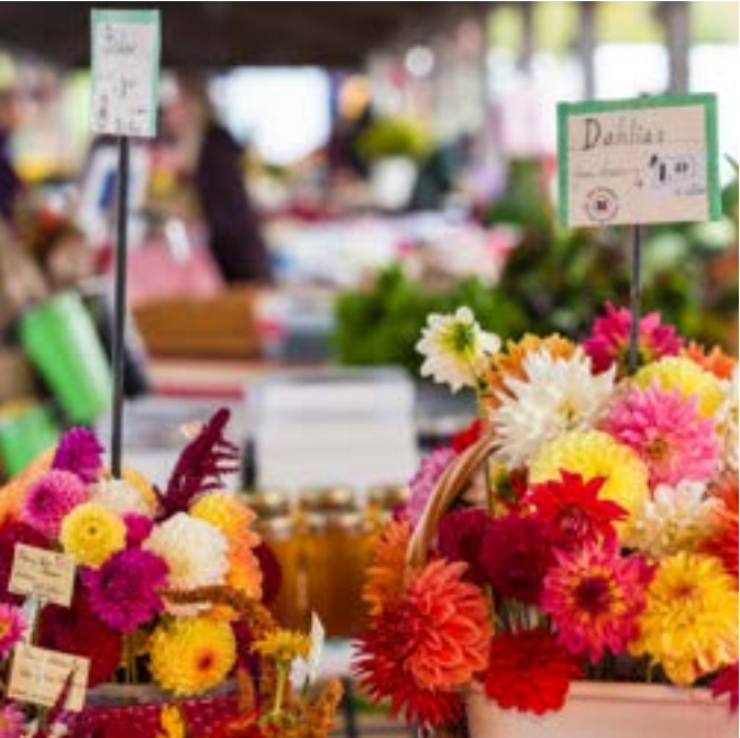
➤ E. Springer Market Square Farmer's Market