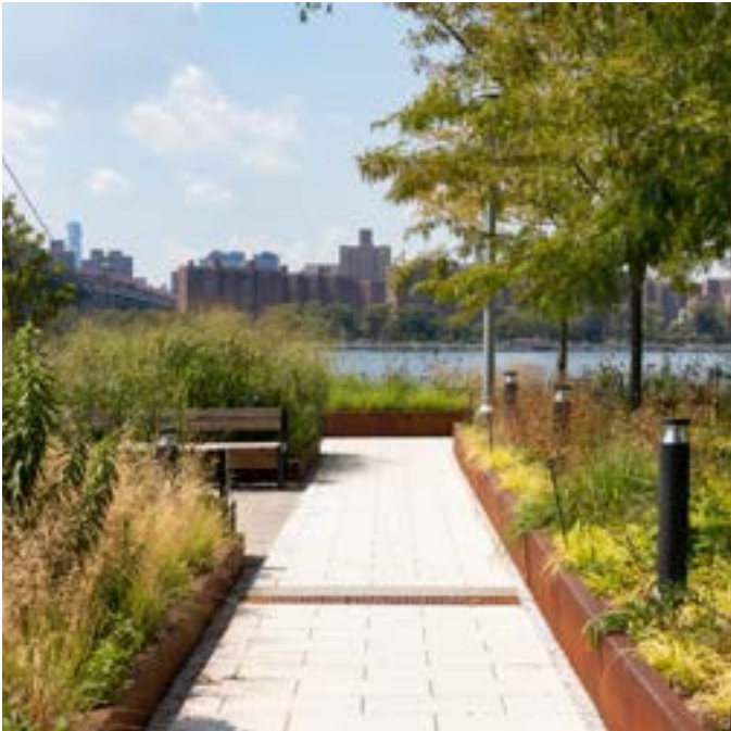
➤ B. Domino Park