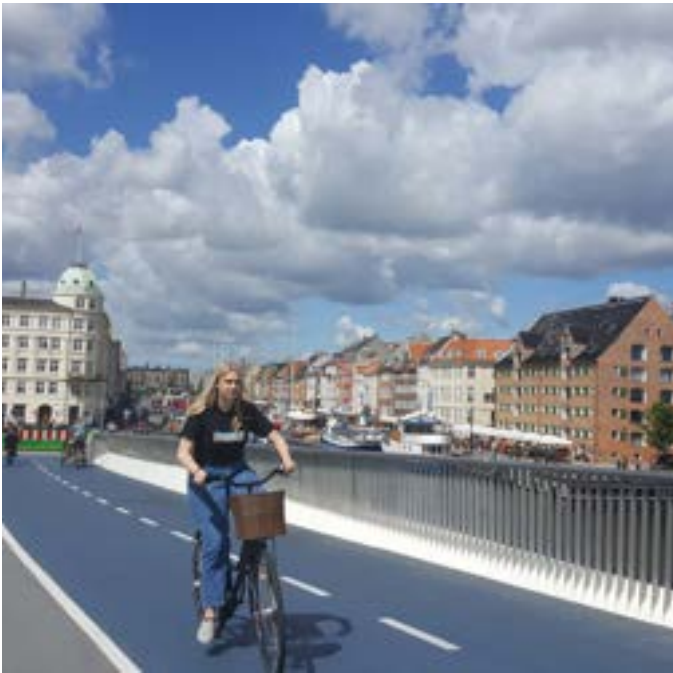
➤ B. Cycle Track