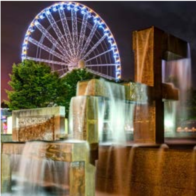
➤ A. Waterfront Park Fountain