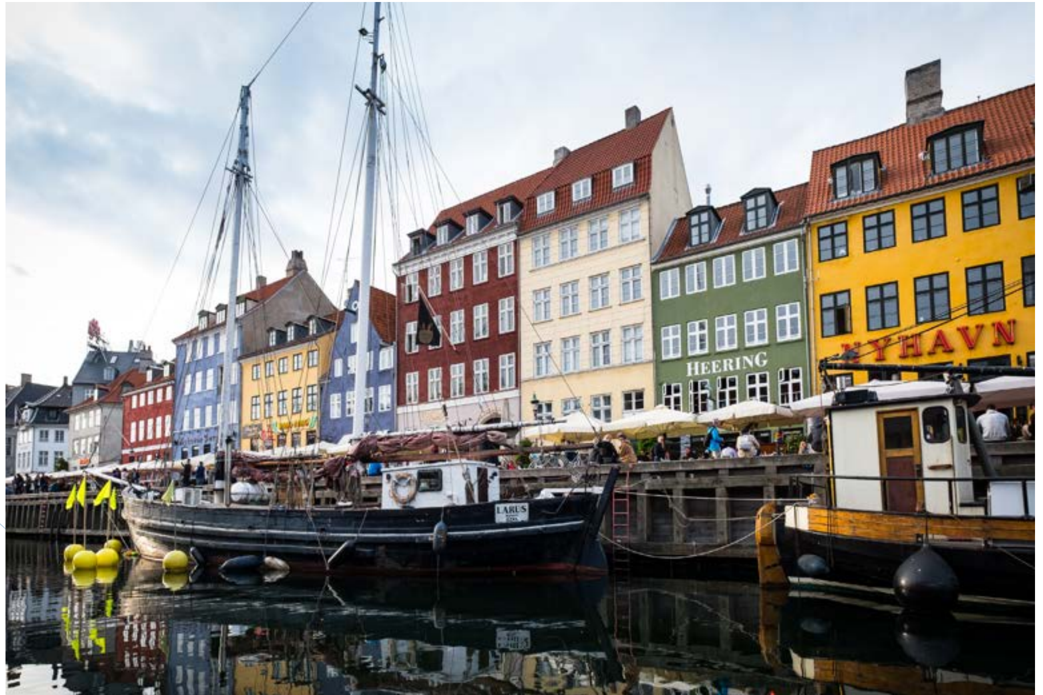
➤ Nyhaven Waterfront in Copenhagen