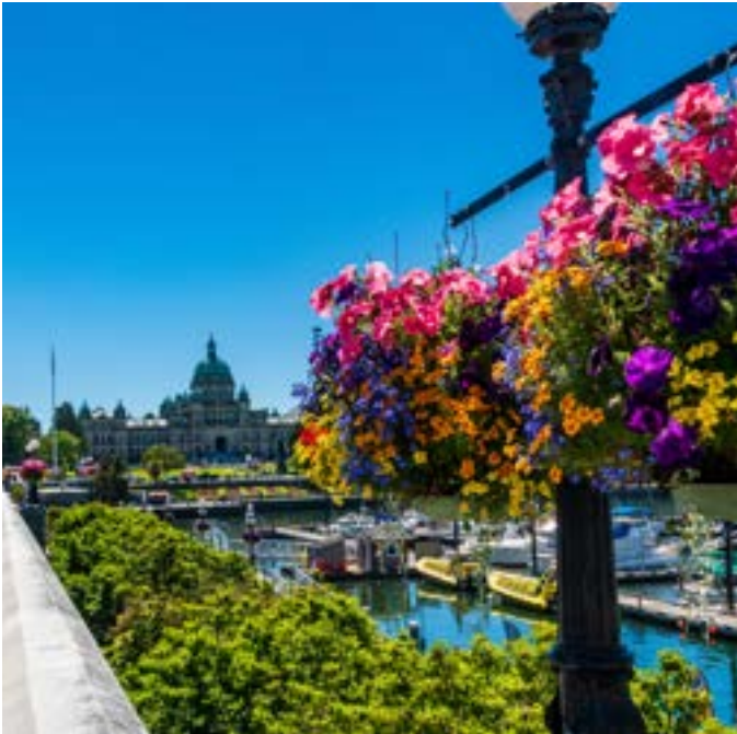
➤ A. The Causeway