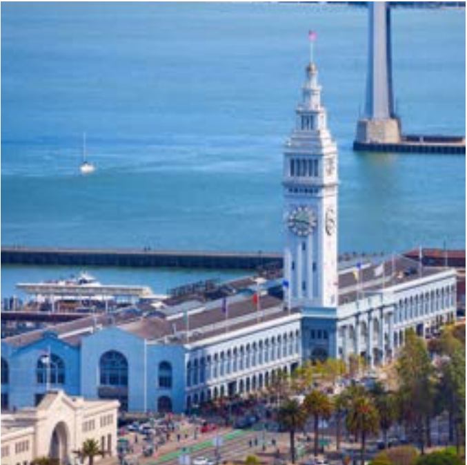
➤ C. Ferry Building Marketplace