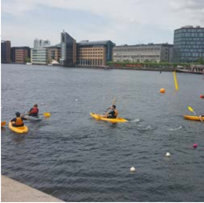
➤ F. Waterfront Kayaking