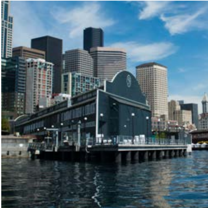
➤ C. Seattle Aquarium