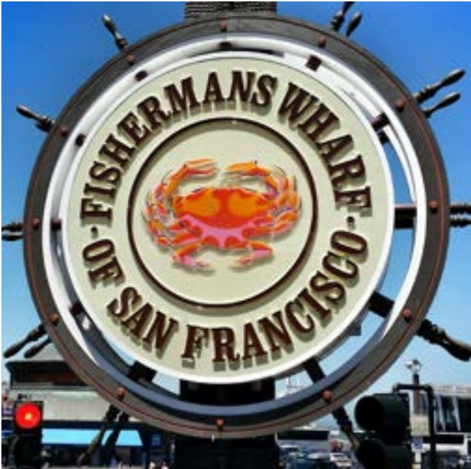
➤ A. Fisherman's Wharf