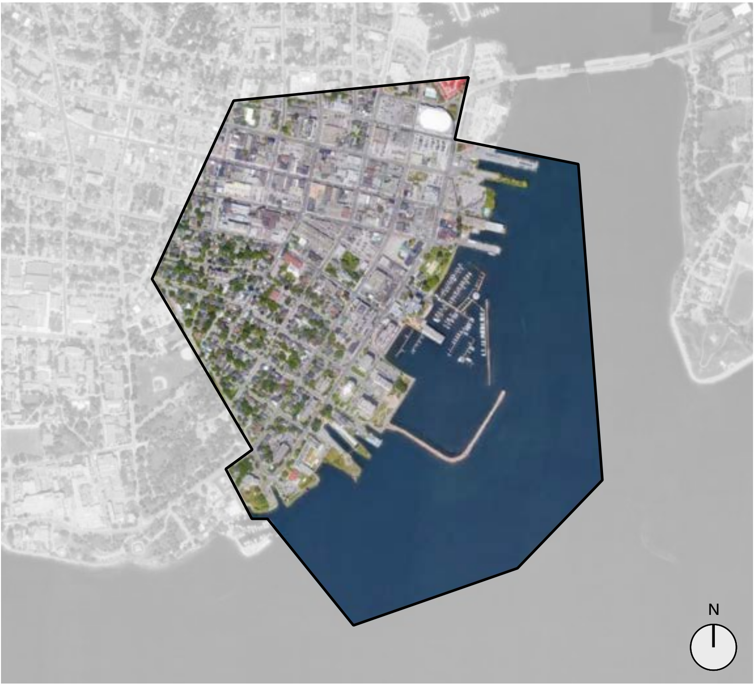
➤ Downtown Kingston Waterfront