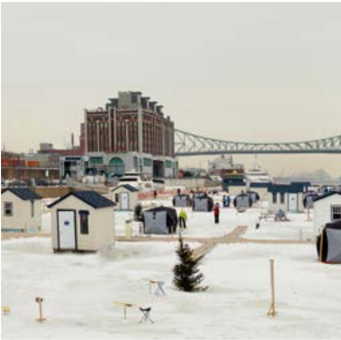
A. Ice Fishing