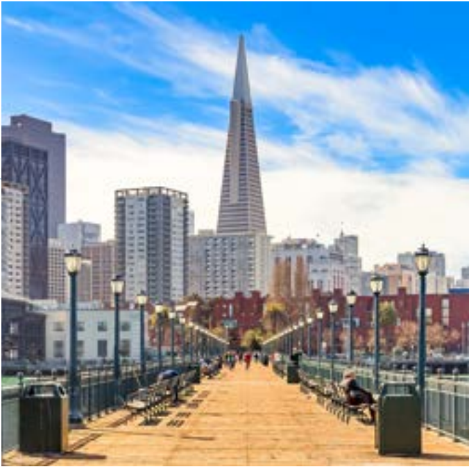
➤ B. Pier 9