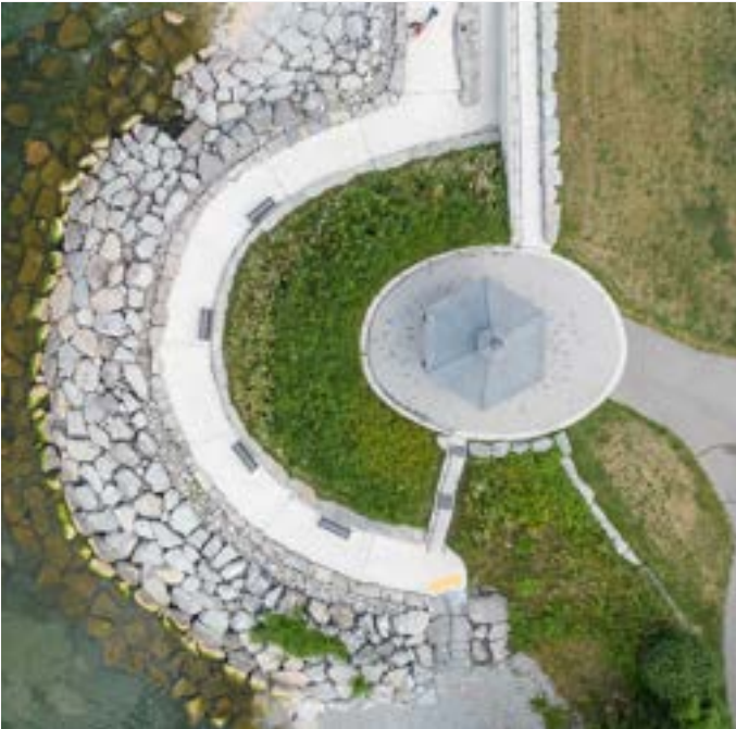
➤ C. Great Lakes Waterfront Trail