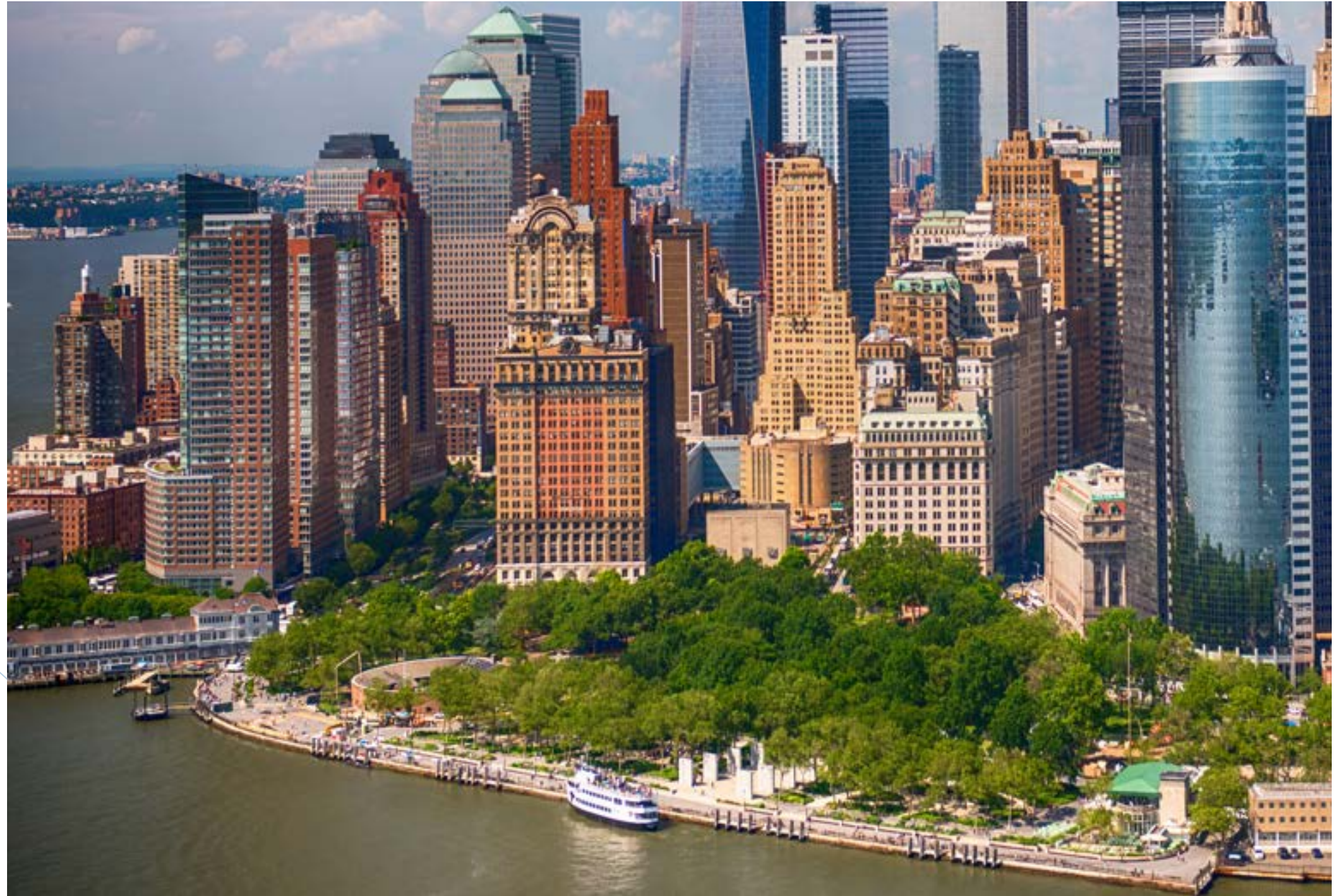
➤ Battery Park & Manhattan