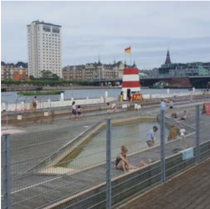
➤ E. Harbour Baths