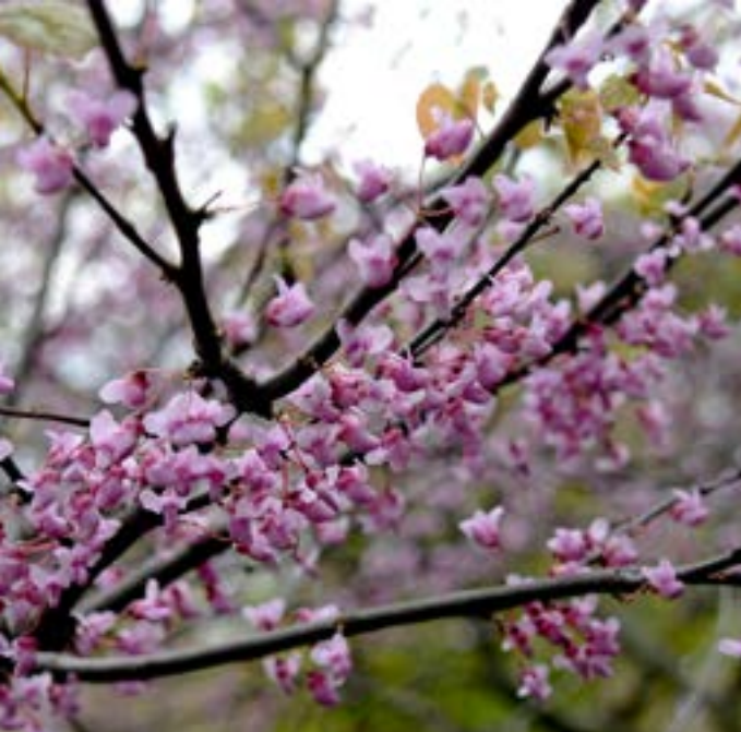
➤ E. Sakura Festival