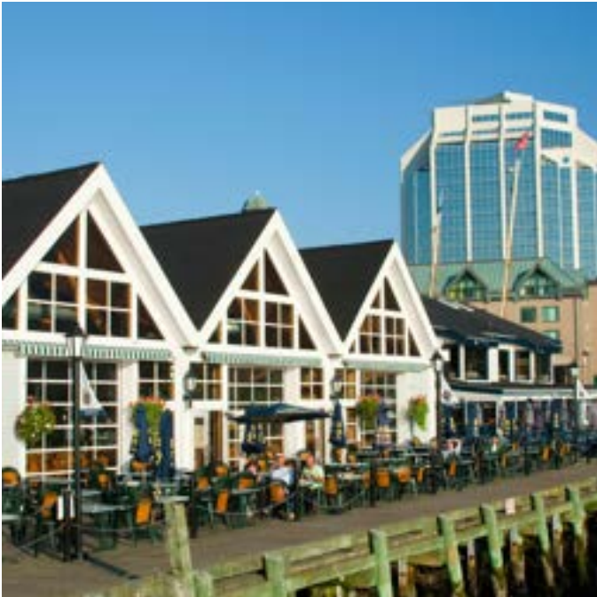
➤ A. Waterfront Dining