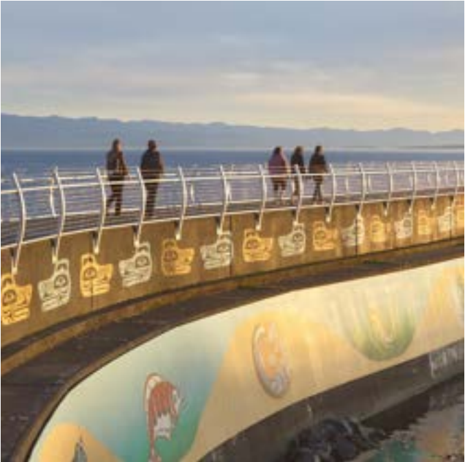
➤ B. The Breakwater/Unity Wall