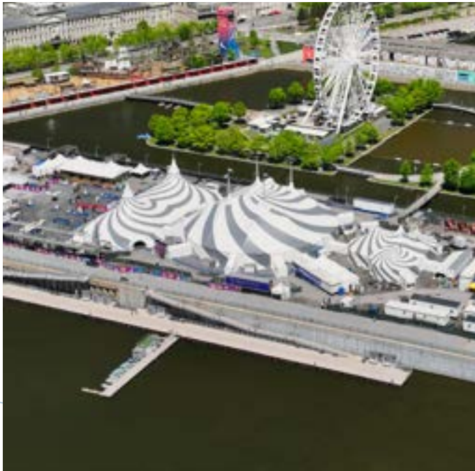
D. Cirque du Soleil