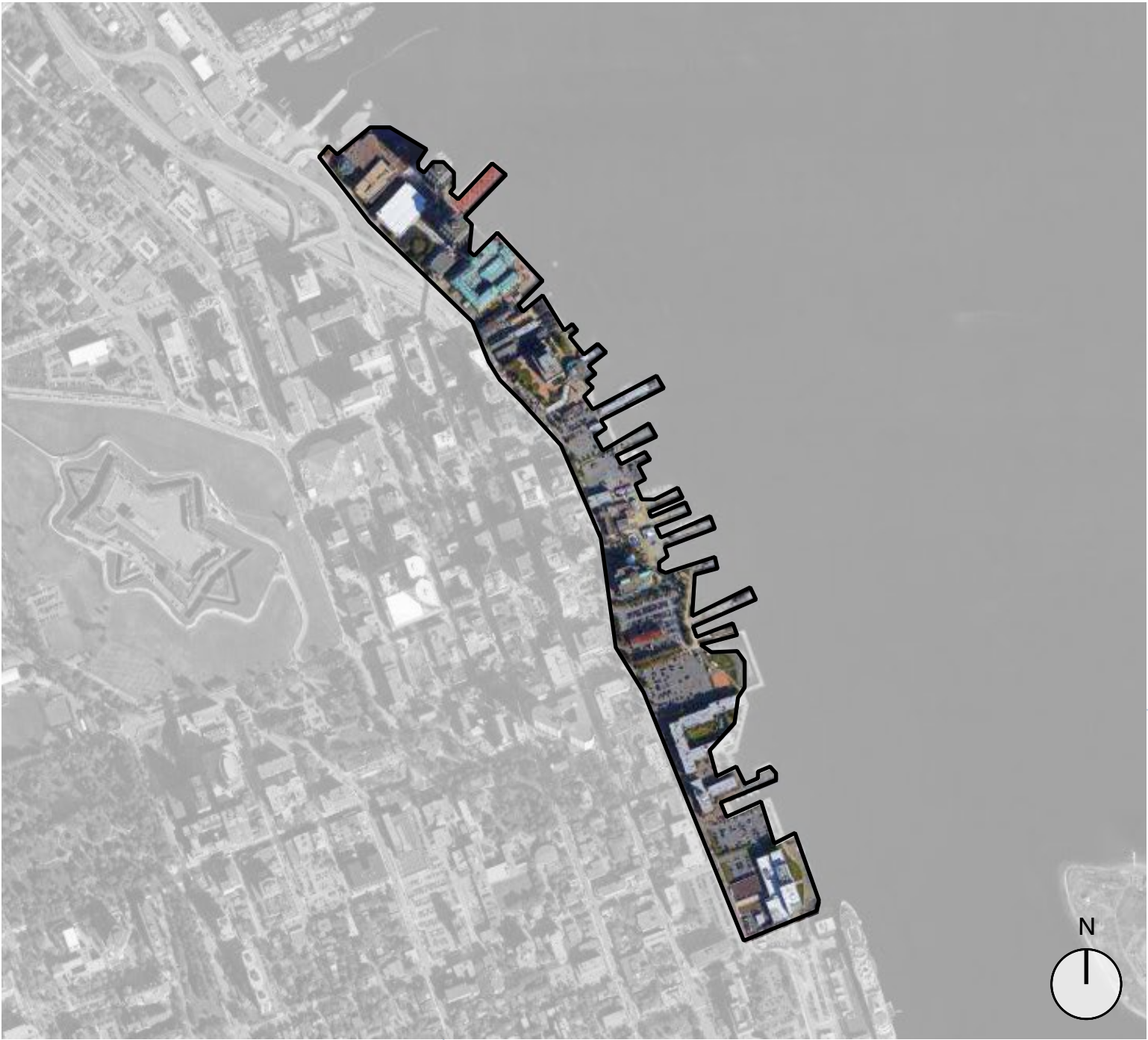
➤ Halifax Waterfront