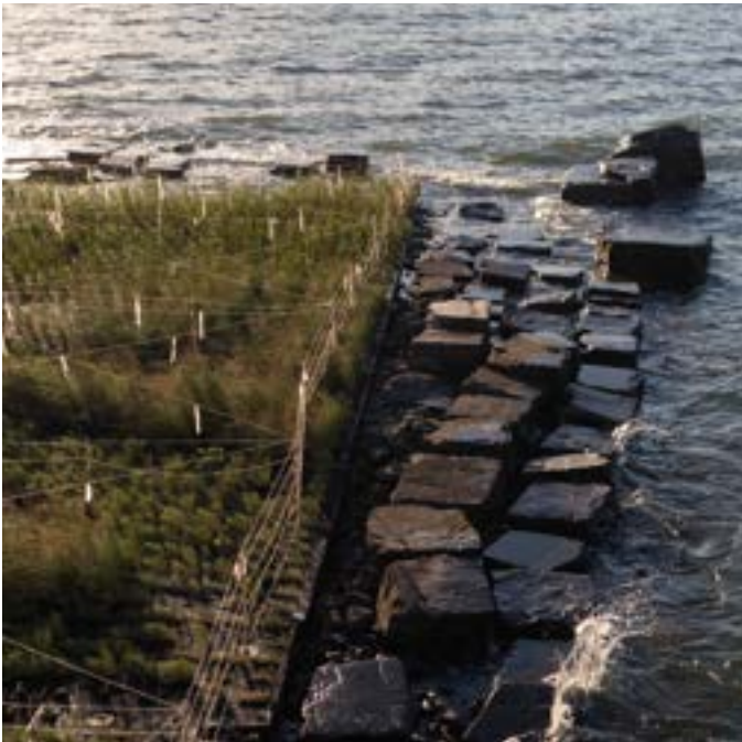
➤ A. Pier 26