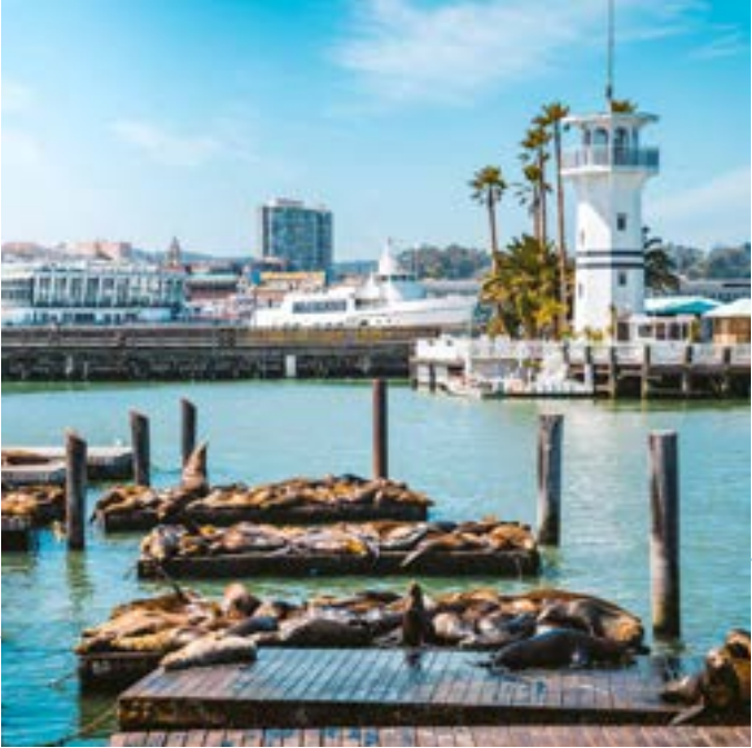
➤ D. Pier 39 Seal Watching