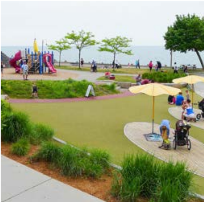
➤ B. Spencer Smith Park