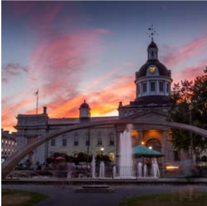
➤ C. Confederation Park Fountain & Confederation Arch