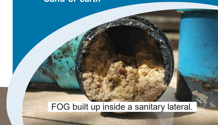
FOG built up inside a sanitary lateral.