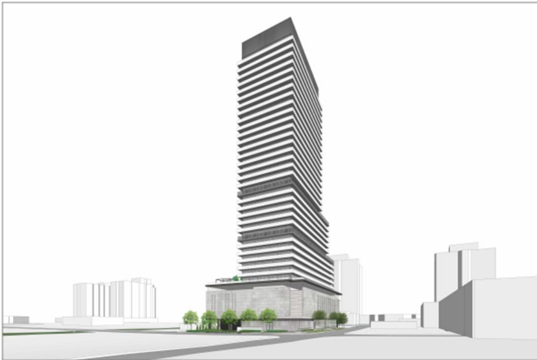
1 SOUTH WEST VIEW AT CORNER OF BRADFORD ST AND VESPRA ST