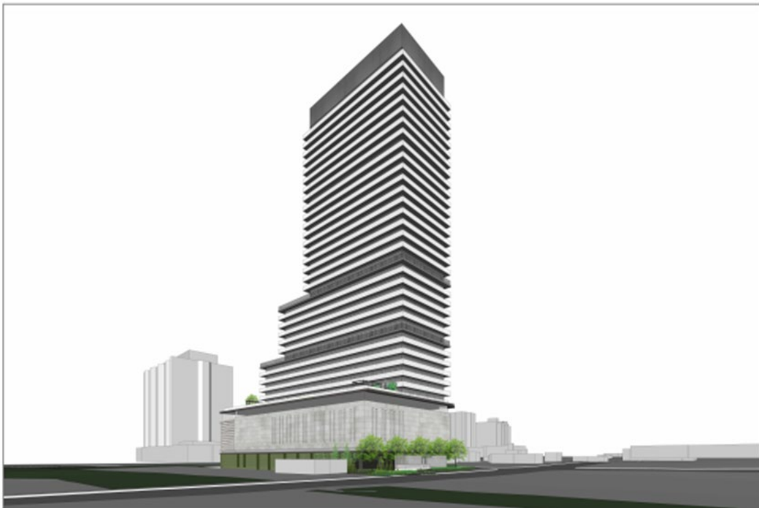
2 NORTH WEST CORNER