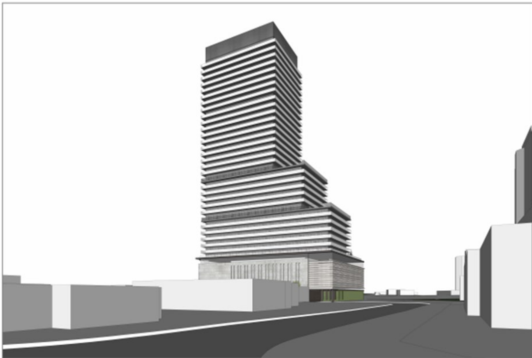
4 SOUTH EAST CORNER