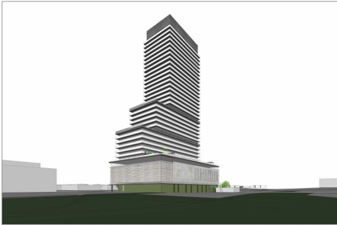
3 NORTH EAST CORNER