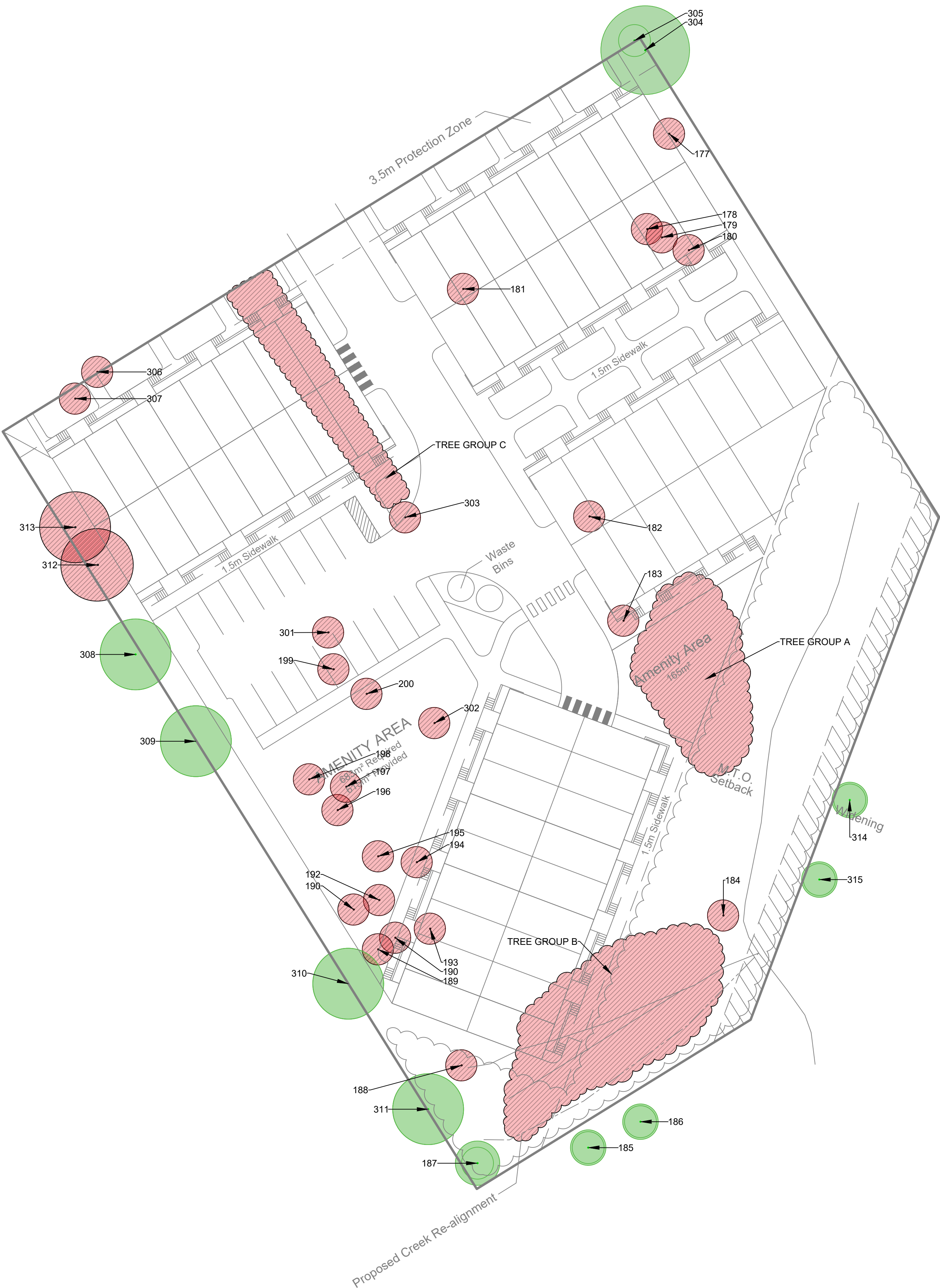
Table 1. Tree Inventory for 105 - 111 Edgehill Drive, City of Barrie. Data was collected by Beacon Environmental Ltd. on May 16, 2018.