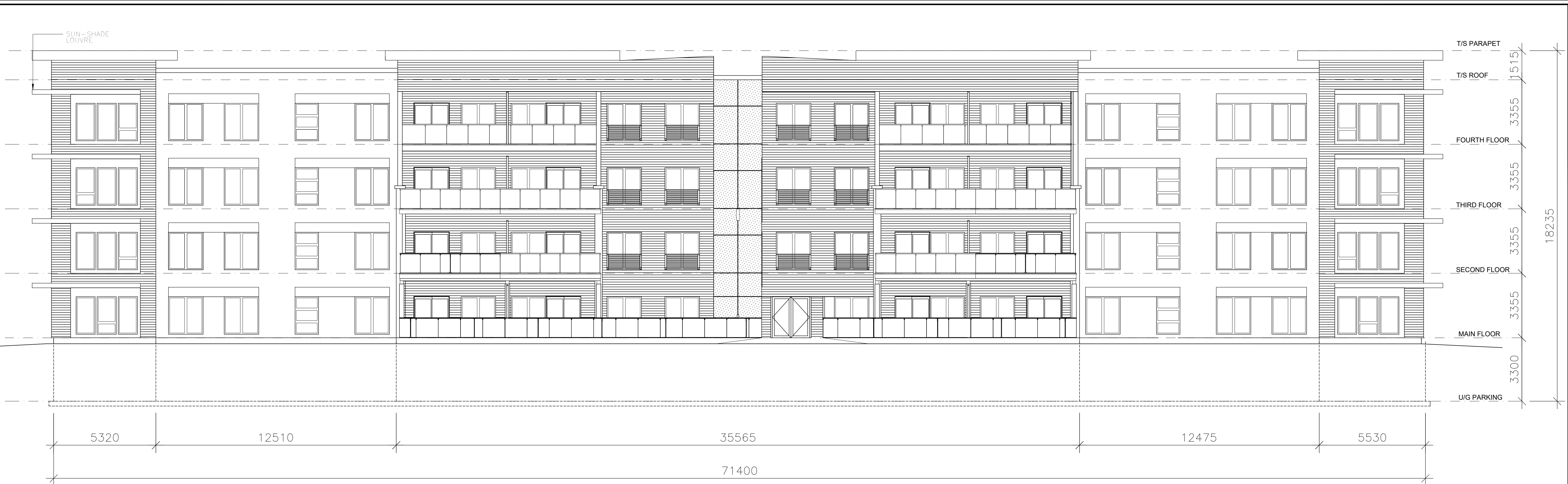
NORTH ELEVATION 1:100 VIEW FROM HARVIE ROAD