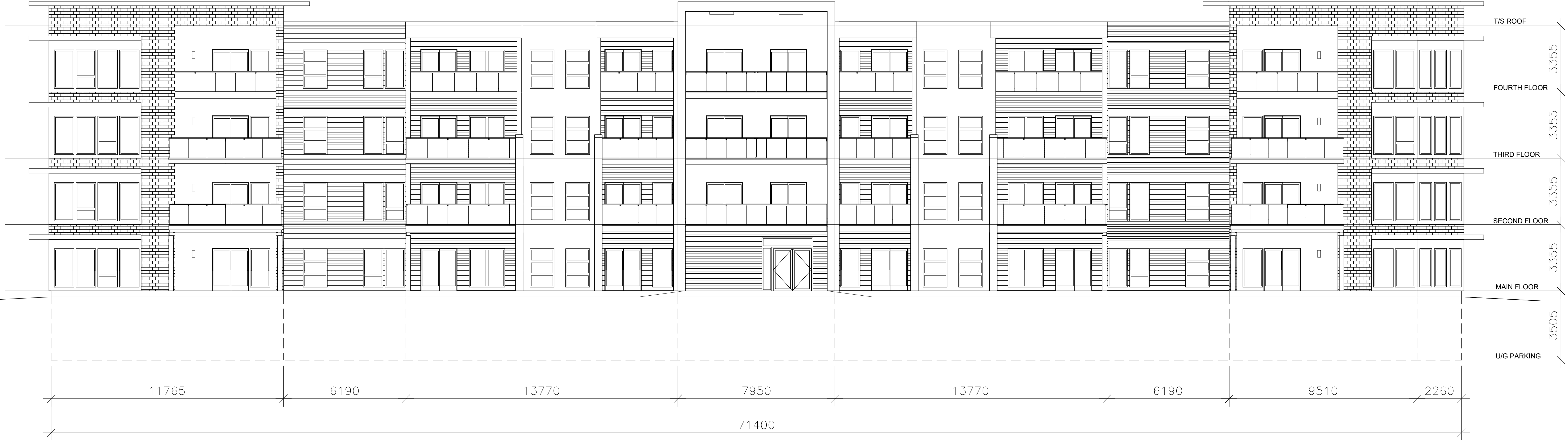
SOUTH ELEVATION 1:100 VIEW FROM HARVIE ROAD

ISM Architects Inc. 97 Toronto Street Barrie, ON L4N 1V1 T: 705.736.2342 E: ian@ismarchitects.ca