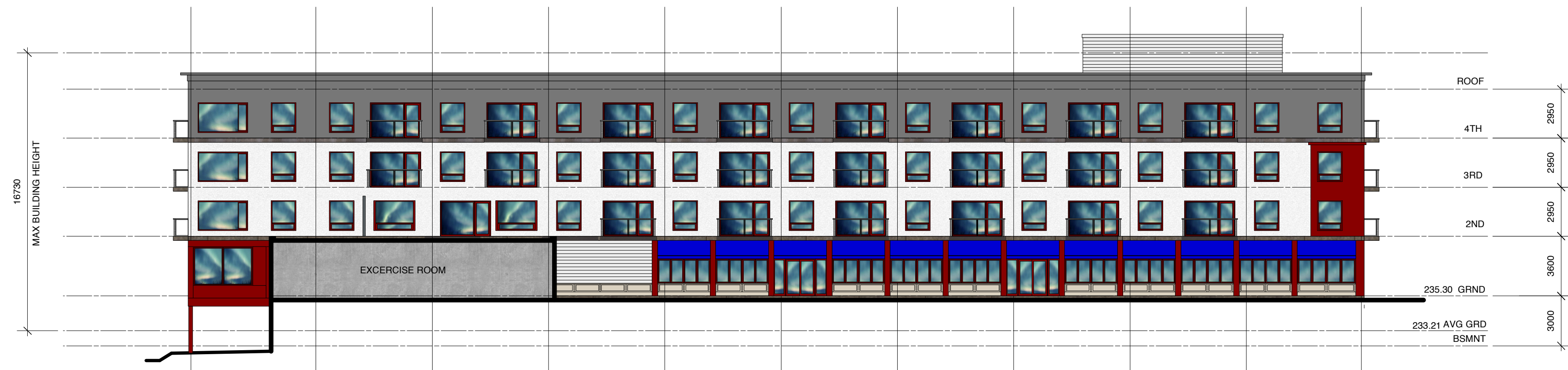
2 EAST ELEVATION A6C Scale: 1:200 EAST SIDE COURTYARD ELEVATION