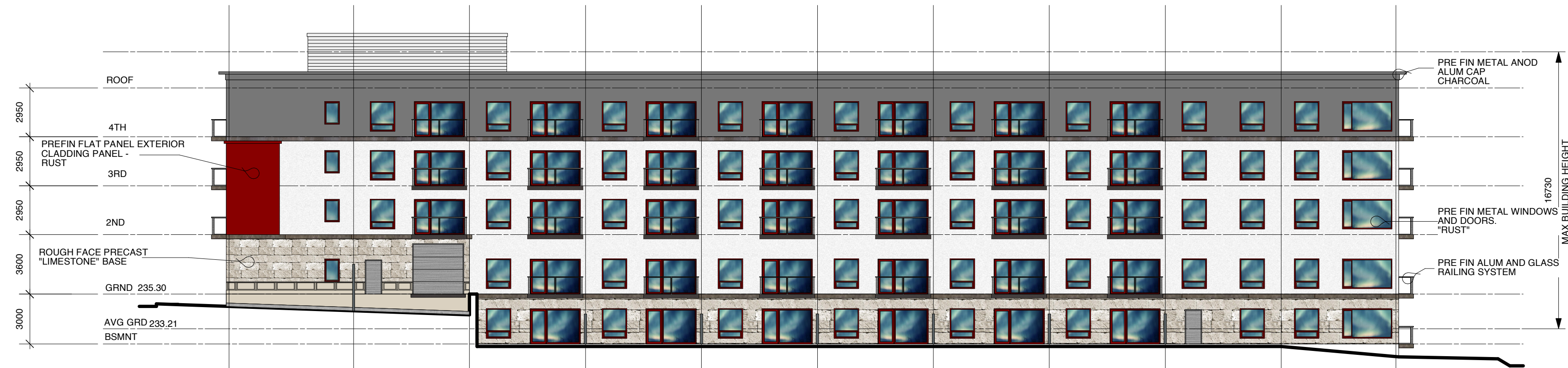
1 EAST ELEVATION A6C Scale: 1:200 EAST SIDE SENIORS HOME ELEVATION