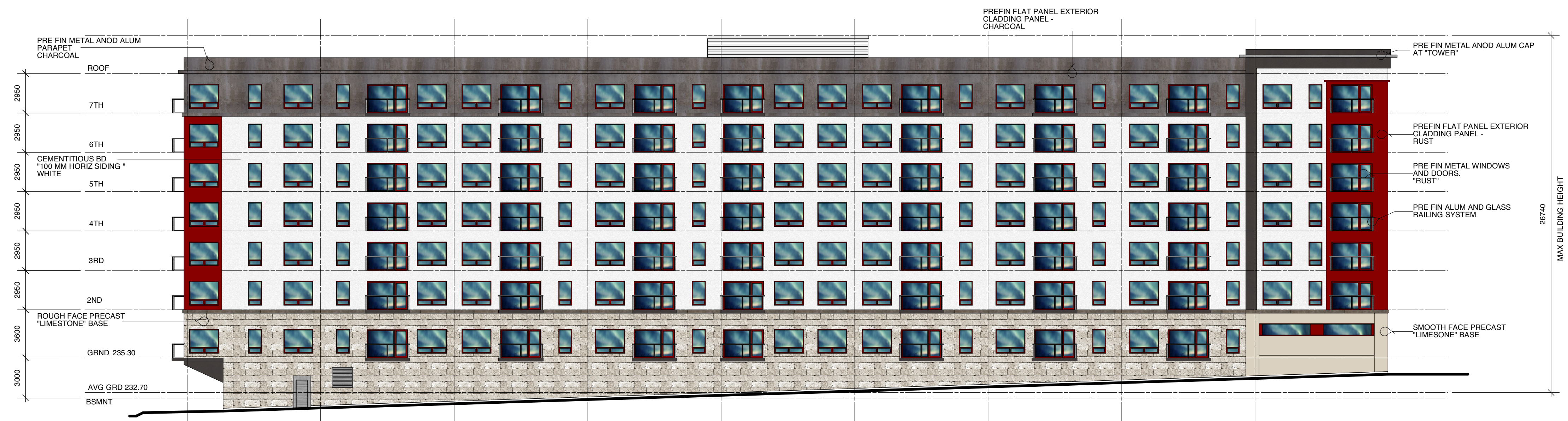
1 WEST ELEVATION A6B Scale: 1:200