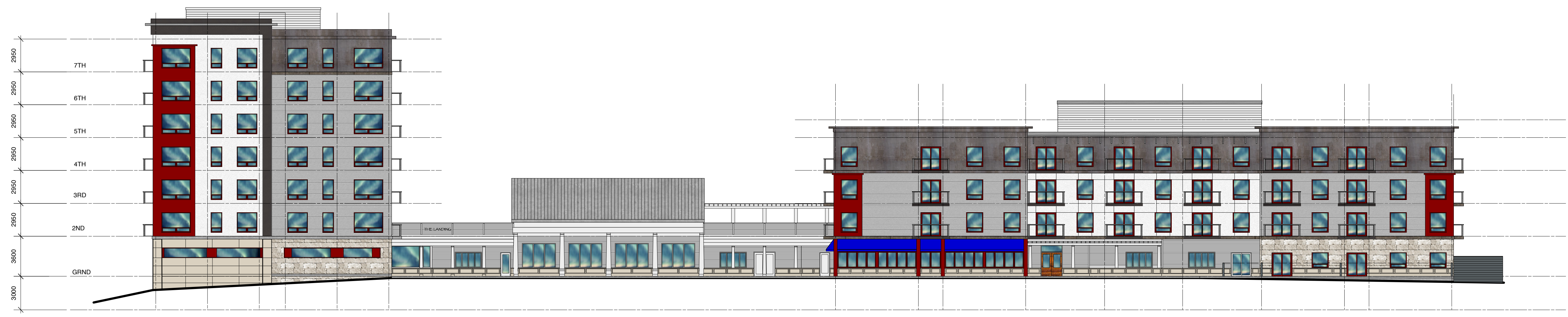
1 FRONT ELEVATION (SOUTH) A6A Scale: 1:200