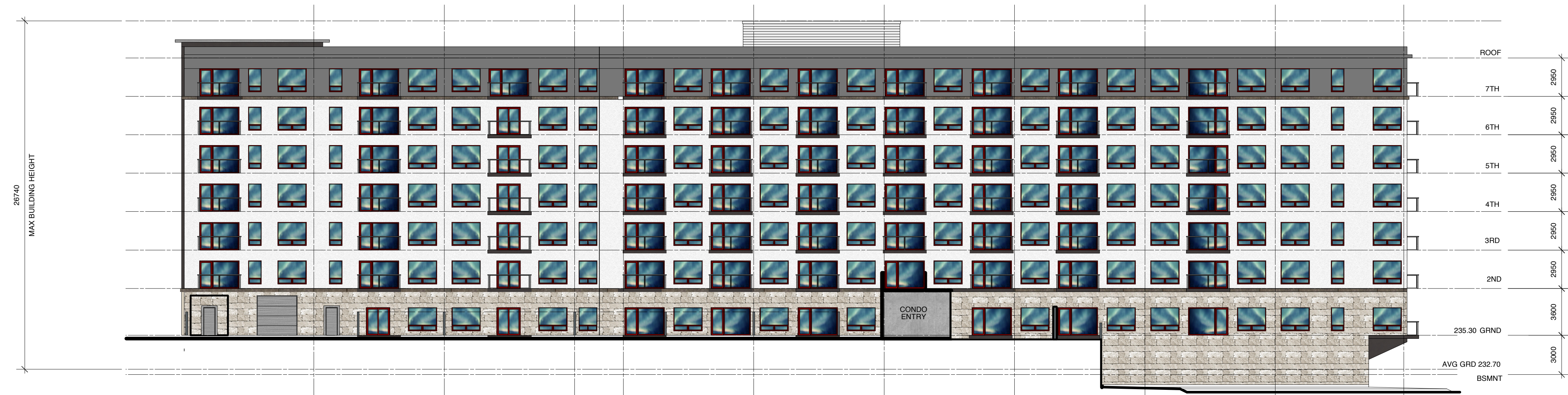
WEST SIDE COURTYARD ELEVATION 2 REAR ELEVATION (NORTH) A6B Scale: 1:200