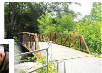
Berzcy Park Bridge