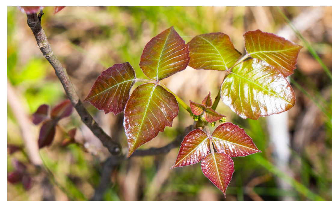
Poison Ivy Spring

Poison ivy is a native plant that generally has three leaves and a red stem. Users are advised to watch for poison ivy in the disc golf course and take precautions to avoid contact with skin to prevent rashes.