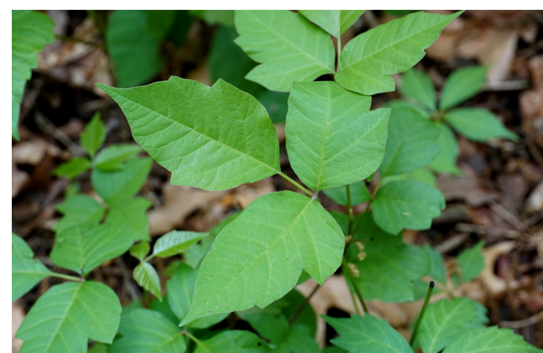
Poison Ivy Summer